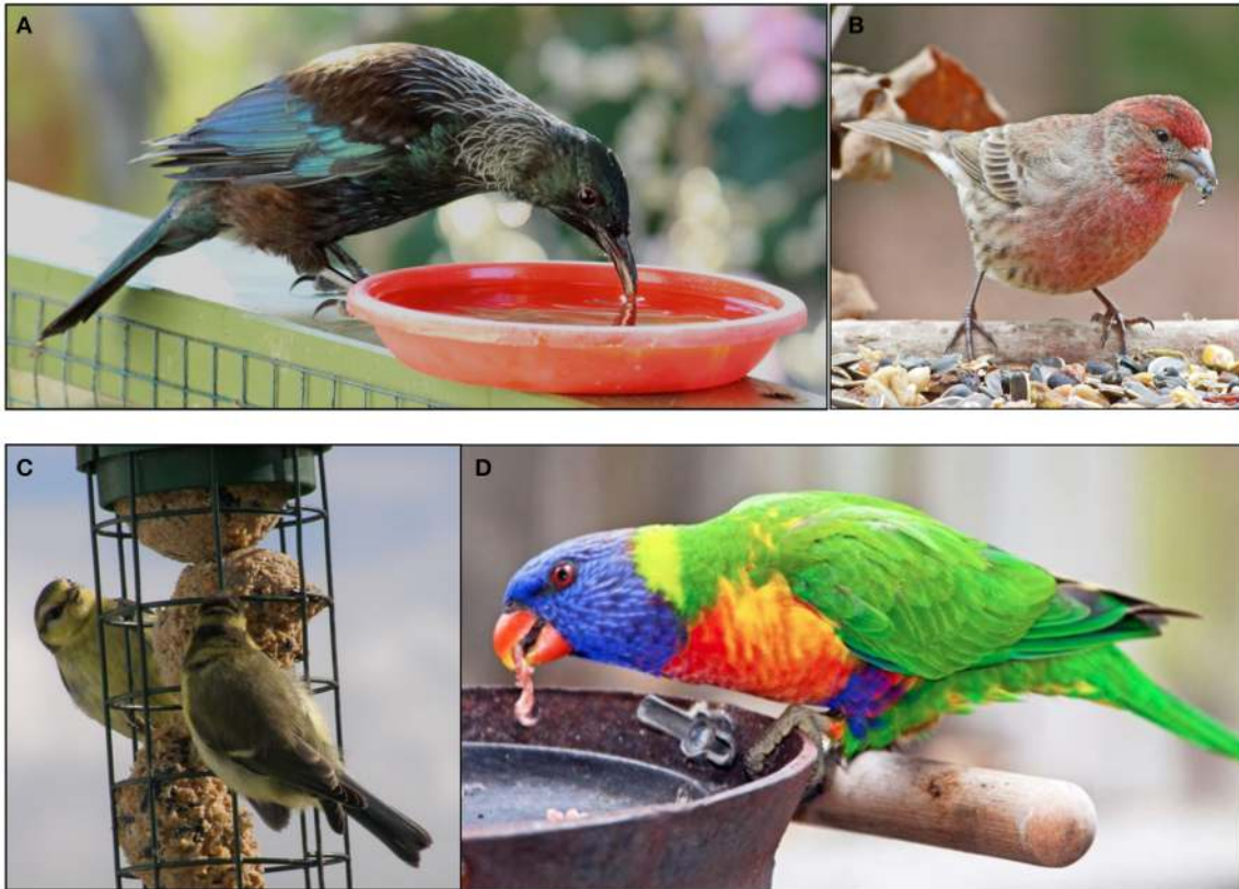
FIGURE 1 | Examples of bird species feeding on food supplements in city gardens in (A) New Zealand (tui Prosthemadura novaeseelandiae ) (Photo: J. Galbraith), (B) the US (house finch Carpodacus mexicanus ) (Photo: B. Vuxinic), (C) the UK (blue tits Cyanistes caeruleus ) (Photo: J. Galbraith), and (D) Australia (rainbow lorikeet Trichoglossus moluccanus ) (Photo: D. Jones).