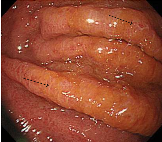
FIGURE 2: Gastric mucosal changes caused by Lugol's solution in a 58-year-old man. The reticular pattern of white lines on the thickened folds is shown by the arrows.