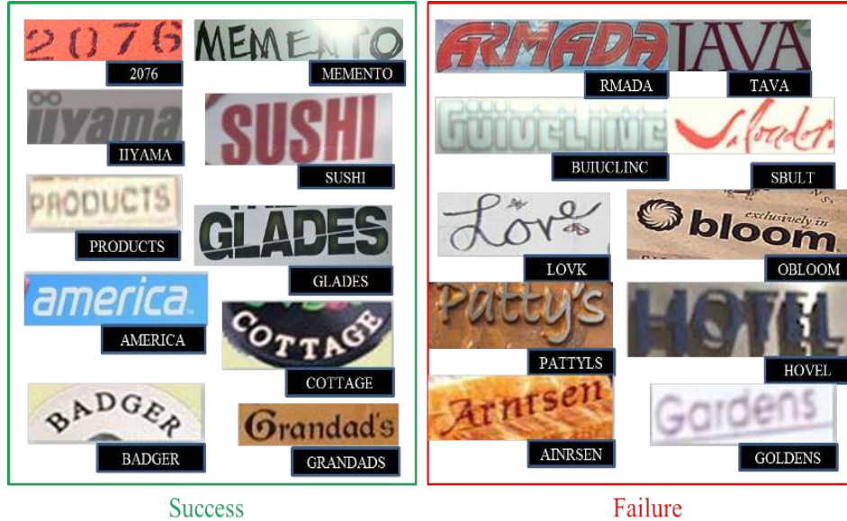
Figure 4: Lexicon-free recognition results by the proposed GRCL-BLSTM framework on SVT, ICDAR03 and IIIT5K

Moreover, we do an extra experiment by building a residual block in feature extraction part. We use the ResNet-20 [9] in this experiment, since it has similar depth with GRCNN with T = 5 . The implementation is similar to what we have discussed in Sec.4.2. The results of ResNet-BLSTM are listed in Table 3. This ResNet-based framework performs worse than the GRCNN-based framework. The result indicates that GRCNN is more suitable for scene text recognition.