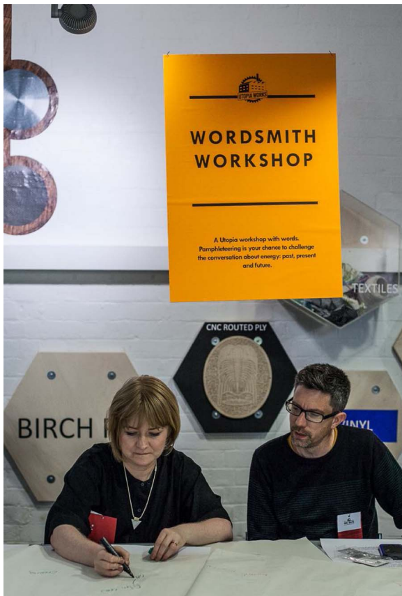
Fig. 3. Drafting pamphlets, Utopia Works, Derby Silk Mill.

hierarchical authority. Everyone was a team player and brought their unique knowledge, experience and limits to the table; we just worked together genially toward the team goal' [67]. A literature PhD student described the conclusion to the event in another blog post: