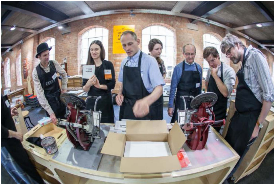
Fig. 4. Printing pamphlets on the letterpress, Utopia Works, Derby Silk Mill. Photo: Gorm Ashurst 2016.

In May 2016, in collaboration with creative and local partners, members of the south Wales based Everyday Lives strand of the Stories project organised a three-day event, the Creative Energy Festival , in the village of Ynysybwl in south Wales. Its main focus was a two-day Story Studio where we invited local residents to engage with the work we had done in the region up until that point, including Ynysybwl itself, exploring the past, present and future of energy in the South Wales valleys. The Studio followed a format that had been deployed in an earlier