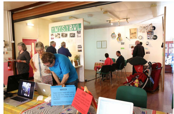
Fig. 6. The Story Studio, Ynysybwl. Photo: Lisa Heledd Jones, 2016.

Such personal and localised accounts allowed visitors to connect with the topic of energy through the narrators' experiences. As a result, listeners then shared their own stories of living in a community that was shaped by energy production, and the individual and collective challenges they face due to the legacy of the coal mining industry. Some were captured in brief glancing sentences on post-it notes as people responded to an image or something they had heard. In other cases people took time to share their oral histories with the research team, generating a more formally structured and recorded body of qualitative data. It was notable that while visitors were at ease sharing