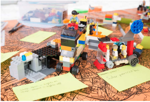
Fig. 2. London energy mapped and modeled at Utopia Fair. Photo: Gorm Ashurst 2016.

covered the tabletop, and labelled with a sticky note. As the game progressed through numerous iterations the map became populated with a growing number of proposed solutions to London's energy challenges.