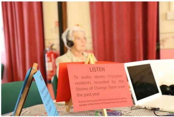
Fig. 5. Listening to digital stories, Ynysybwl. Photo: Lisa Heledd Jones, 2016.

phase of the Everyday Lives work. These valleys have been physically, economically and culturally shaped by coal extraction, and more recently have been the site of some of the biggest wind turbine arrays in the UK. After consultation with community partners, we chose the local community centre as the Studio's location, taking it over for the duration and transforming it into an interactive space designed to present our research and to invite people's responses to it. We created a setting for people to listen to short versions of oral history interviews that the team had conducted in the village in the summer of 2015, one year previously, which had specifically addressed the topic of energy (Fig. 5). Visitors could pick up wireless headphones playing the stories on a loop and listen to as much or as little as they liked. We also provided laptops and invited visitors to watch digital stories we had created with participants in separate research activity in another valleys village, Treherbert, in the previous summer.