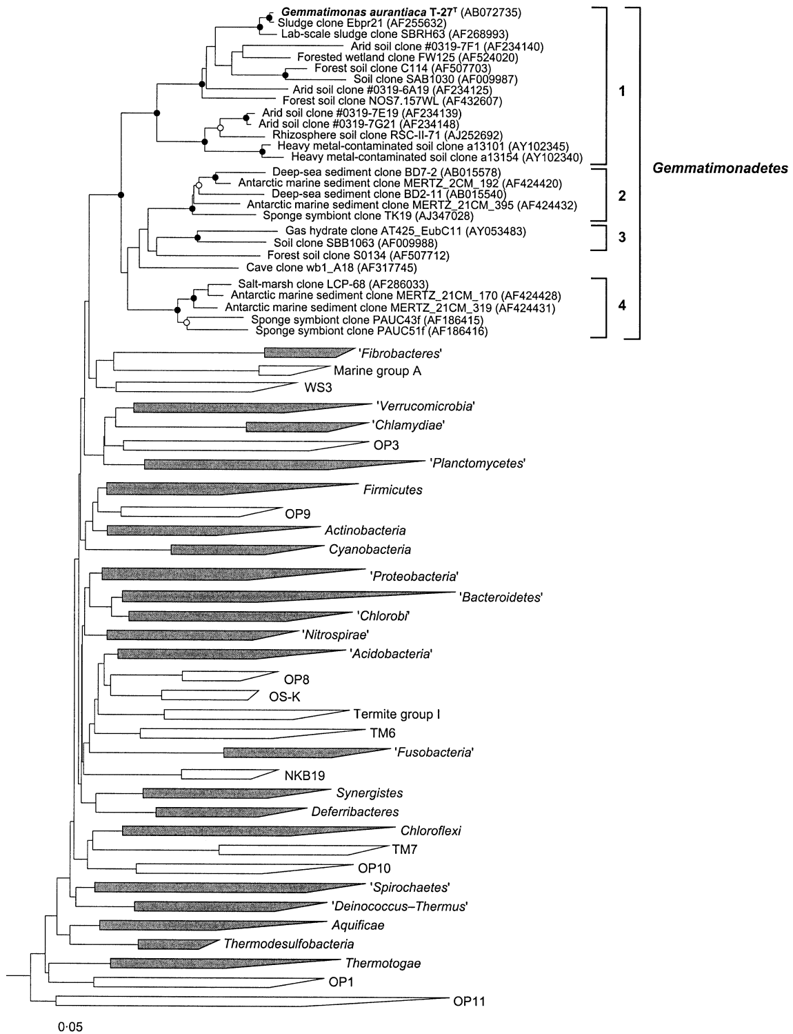
Fig. 3. Evolutionary-distance dendrogram of strain T-27 T and associated representatives of the phylum Gemmatimonadetes and other bacterial phyla (shown as wedges). Shaded wedges indicate phyla with cultivated representatives and unshaded wedges indicate phyla currently represented only by environmental sequences. The phylum Gemmatimonadetes and its subdivisions are indicated by brackets to the right. Branch points supported (bootstrap or posterior probability values > 90%) by all inference methods are indicated by solid circles, while open circles at branch points indicate > 75% bootstrap or posterior probability support in most or all analyses. Branch points without circles were not resolved (< 75%) as specific groups in all analyses. Bar, 0.05 changes per sequence position.