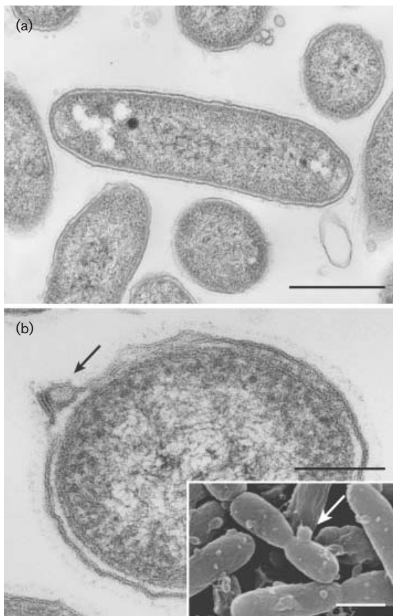
Fig. 2. Electron micrographs of cells of strain T-27 T . (a) Transmission electron micrograph showing a Gram-negative cell envelope structure. Bar, 0.5 \mu m. (b) Transmission and scanning (inset) electron micrographs of cells of strain T-27 T , suggesting asymmetric cell division. Budding structures are shown by arrows, Bar, 0.25 \mu m (inset, 0.5 \mu m).

trehalose, raffinose, arabinose, xylose, rhamnose, glycerol, ethanol, 1-propanol, erythritol, mannitol, sorbitol, lactate, citrate, pyruvate, propionate, malate, butyrate, glutamate, aspartate, alanine, starch, glycogen, gentiobiose, turanose, methyl pyruvate, 2-oxoglutarate, \alpha -ketovalerate, serine, histidine, glycine, leucine and Casamino acids.