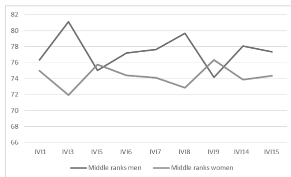
Fig. 2. Middle ranks of the results between men and women on each variable of reading and accessing information by people with visual impairment

We found no statistically significant differences on any manifest individual variables for reading and accessing information by persons with visual impairment, since the significances ( p > 0.05 ) are higher than 0.05. This means that there were no significant differences between men and women. All results of middle ranks for men and women are presented in Figure 2.