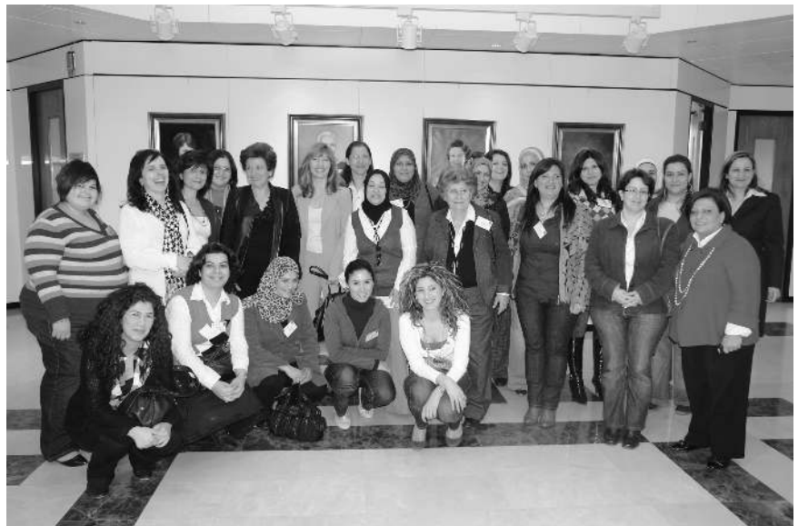
Group picture of the participants in the workshop.