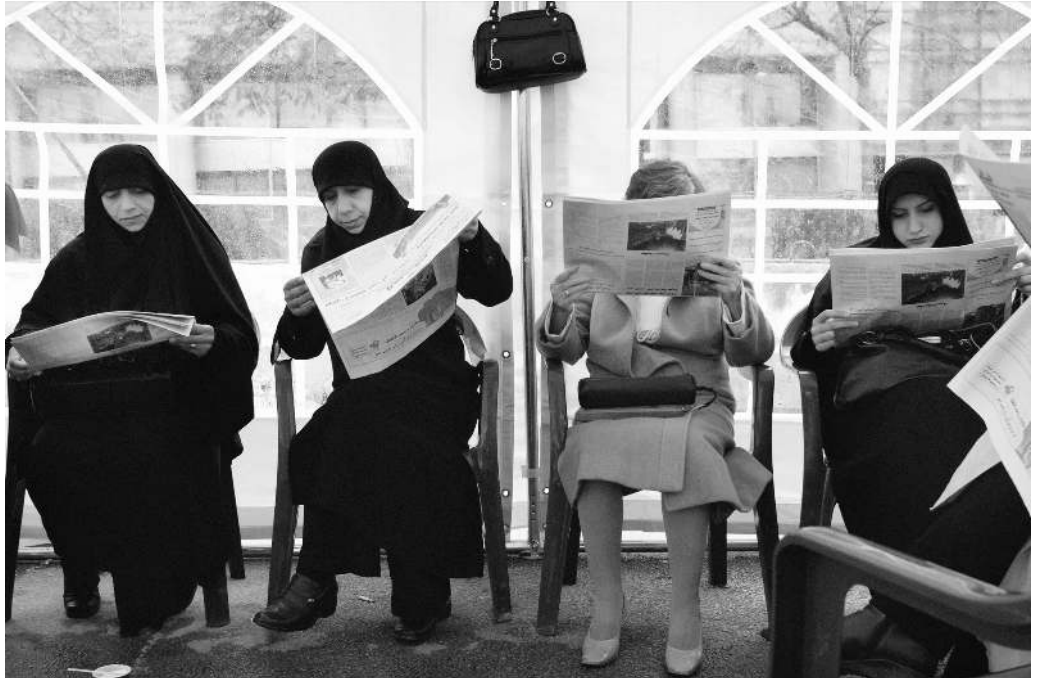
Newspapers, Beirut 2007.

up for this shortcoming by the questions they raise, the insights they contribute, and the objective assessments they provide.