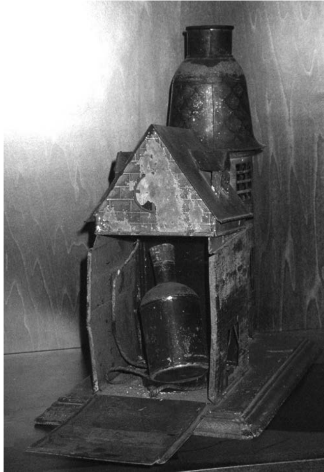
Gunpowder Building. Setting off the gunpowder bomb, shown inside the lithographed tin building, causes it to collapse, and wakes up the students in the back row of the classroom. The apparatus is in the Moosenick Museum at Transylvania University in Lexington, Kentucky. (Photograph and Notes by Thomas B. Greenslade, Jr., Kenyon College)

14 J.-M. Vigoureux, "The reflection of light by planar stratified media: The groupoid of amplitudes and a phase Thomas precession," J. Phys. A 26 , 385–393 (1993).