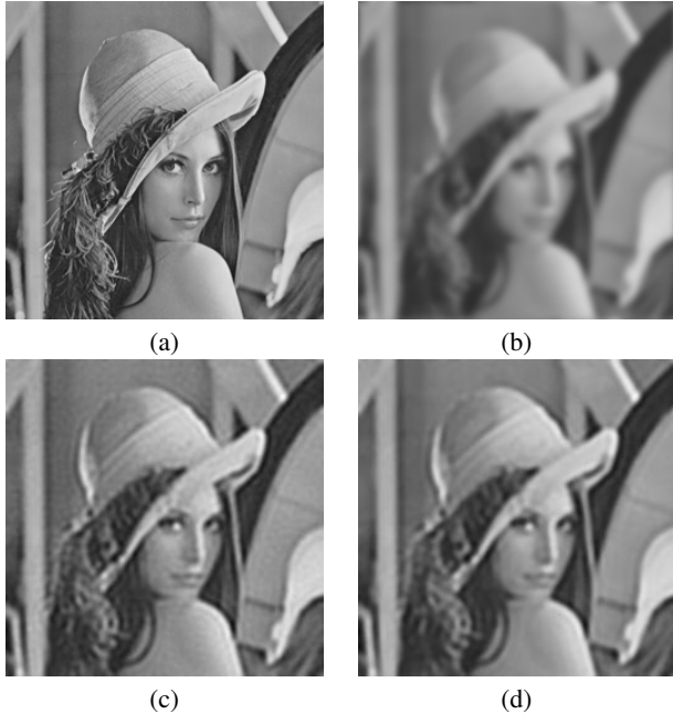
Fig. 2. (a) Original Lena Image, (b) Image degraded by a Gaussian shaped PSF with variance 9 and Gaussian noise of variance 0.16 (BSNR=40dB), (c) Restored image using Algorithm 1 with p = 1.8 (ISNR = 4.15dB), (d) Restored image using Algorithm 2 with p = 1.6 (ISNR = 3.78dB).

image \mathbf{x} . The initial values of the hyperparameters and \mathbf{v} are initialized using this initial \mathbf{x} and Eqs. (18)-(20). Note that all parameters of the algorithms are initialized using the observation \mathbf{y} so that no manual input is needed, i.e., both algorithms are initialized and run automatically. For all experiments, the criterion \| \mathbf{x}^k - \mathbf{x}^{k-1} \|^2 / \| \mathbf{x}^{k-1} \|^2 < 10^{-4} is used to terminate the iterative procedure.