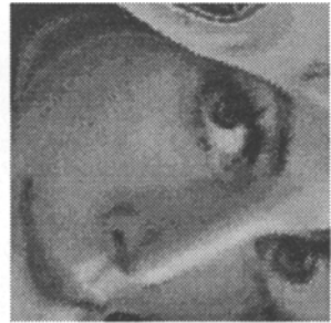
Fig. 5: Mapping of Fig. 1 by rsq_{70^\circ}