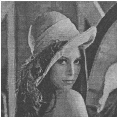
Fig. 8: Decoded image using gen. square isometries