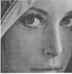
Fig. 1: Initial square

is a one-to-one conformal mapping of the unit square into the unit disk. The effects of \varphi are illustrated in Figs. 1 and 2, where the square of Fig. 1 is mapped into the disk of Fig. 2 by \varphi .