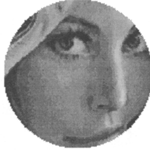
Fig. 2: Mapping of Fig. 1 by \varphi

For any angle \theta, \theta \in [0, 360^\circ) we denote by r_\theta the usual clockwise rotation of angle \theta :