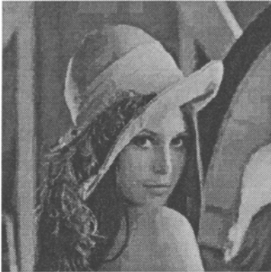
Fig. 6: Decoded image using 8 classical isometries

We use an adaptive coding scheme that splits the image into non-overlapping square range blocks, according to a tree structure. This tree structure is more flexible than a quadtree, with smoother transitions in block sizes [5]. It uses 4 \times 4 , 6 \times 6 , 8 \times 8 and 12 \times 12 size range blocks.