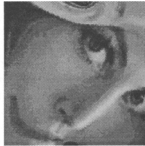
Fig. 4: Mapping of Fig. 1 by rsq_{55^\circ}