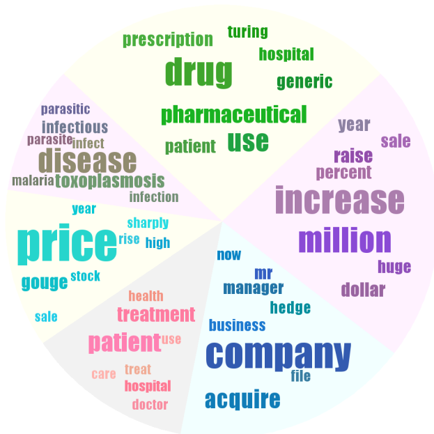
Figure 2: Topic Cloud of the pharmaceutical company acquisition news.