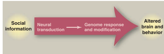
Fig. 2. Vector 1: From social information to changes in brain function and behavior. Social information is perceived by sensory systems and transduced into responses in the brain. Social information leads to developmental influences often mediated by parental care, as well as acute changes in gene expression that cause diverse effects (e.g., changes in metabolic states, synaptic connections, and transcriptional networks). Social information also can cause epigenetic modifications in the genome. Variation in both environment ( V_E ) and genotype ( V_G ) influences how social information is received and transduced and how these factors themselves interact ( V_E \times V_G ).

Social signals can also trigger long-lasting epigenetic modifications of the genome. These are heritable changes in expression of specific genes that are not attributable to changes in DNA sequence (Fig. 2). This phenomenon was first dis-