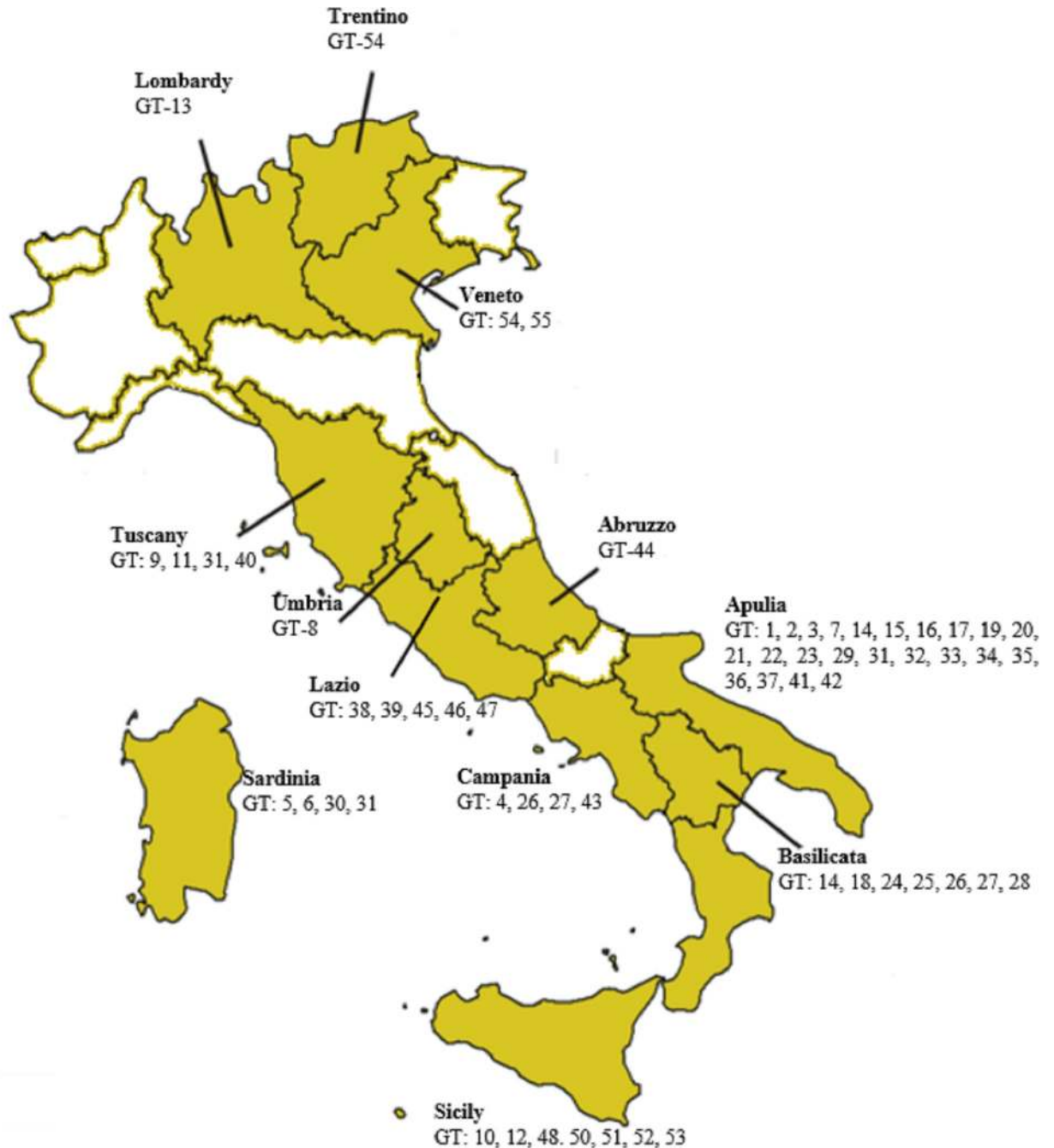
Fig 1. The geographical distribution of 55 Bacillus anthracis genotypes in Italy. Image modified from the “Map of Italy”; “World of Maps” Public Domain ( https://www.worldofmaps.net/europa/landkarten-und-stadtplaene-von-italien/landkarte-italien-administrative-bezirke-regioni.htm ).

https://doi.org/10.1371/journal.pone.0227875.g001