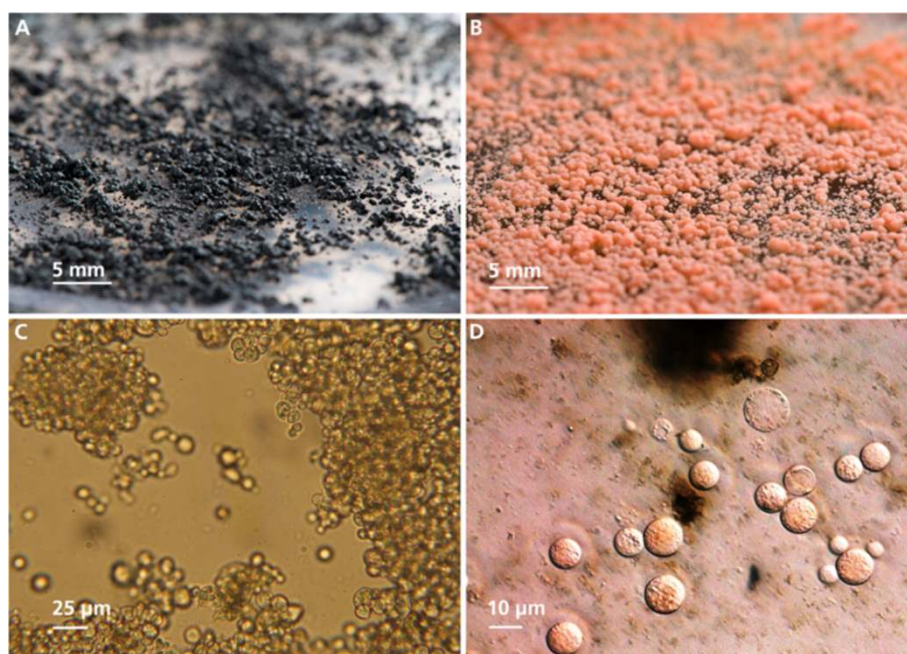
Figure 1 Knufia petricola A95 morphology. A - Being a typical MCF, K. petricola A95 retains protective pigmentation and restricted colony growth even under favourable growth conditions on a Petri dish; B - As a result of a spontaneous mutation, the A95 pink mutant (A95p) is deficient in melanin synthesis. The orange/red colour is caused by carotenoids that are normally masked by melanins. C - Micrograph of A95 cells with melanin. The ball-shaped, compact A95 cells are surrounded by a thick cell-wall and are embedded in extracellular polymeric substances that are arranged in compact clusters of cells. D - A95 protoplasts prepared from similar cells to those shown in Figure 1C. A95 protoplasts were most effectively isolated by digestion of the cell-wall using lysing enzymes from Trichoderma harzianum and prevented from bursting in a 1M KCl buffer.