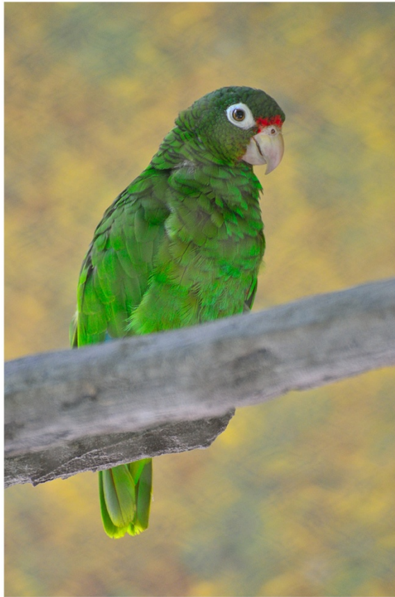
Figure 2 Puerto Rican parrot at the new Puerto Rican Zoo Juan A Rivero exhibit in Mayaguez.

bioinformatics were trained to drive assemblers, to stitch together contigs and scaffolds, and to begin the genome annotation process. Third, the Puerto Rican parrot is a harbinger for the many parrot genomes we shall be seeing in the near future: the opportunity to explore speciation and adaptive radiation among island species of these parrots is too tempting to pass up (Figure 1). The Genome 10 K sponsored Assemblathon-II (led by Ian Korf) ( http://assemblathon.org ) is evaluating assembly strategies for three vertebrate species: a cyprinid fish, a python, and a parakeet songbird ( Melospiza undulatus ) [5]. And great things are expected from the BGI-Genome 10 K Avian phylogenomics consortium (led by Erich Jarvis) annotating the genomes of 48 plus avian species including more parrots, such as the Kea ( Nestor notabilis ) coming later in 2012 [6].