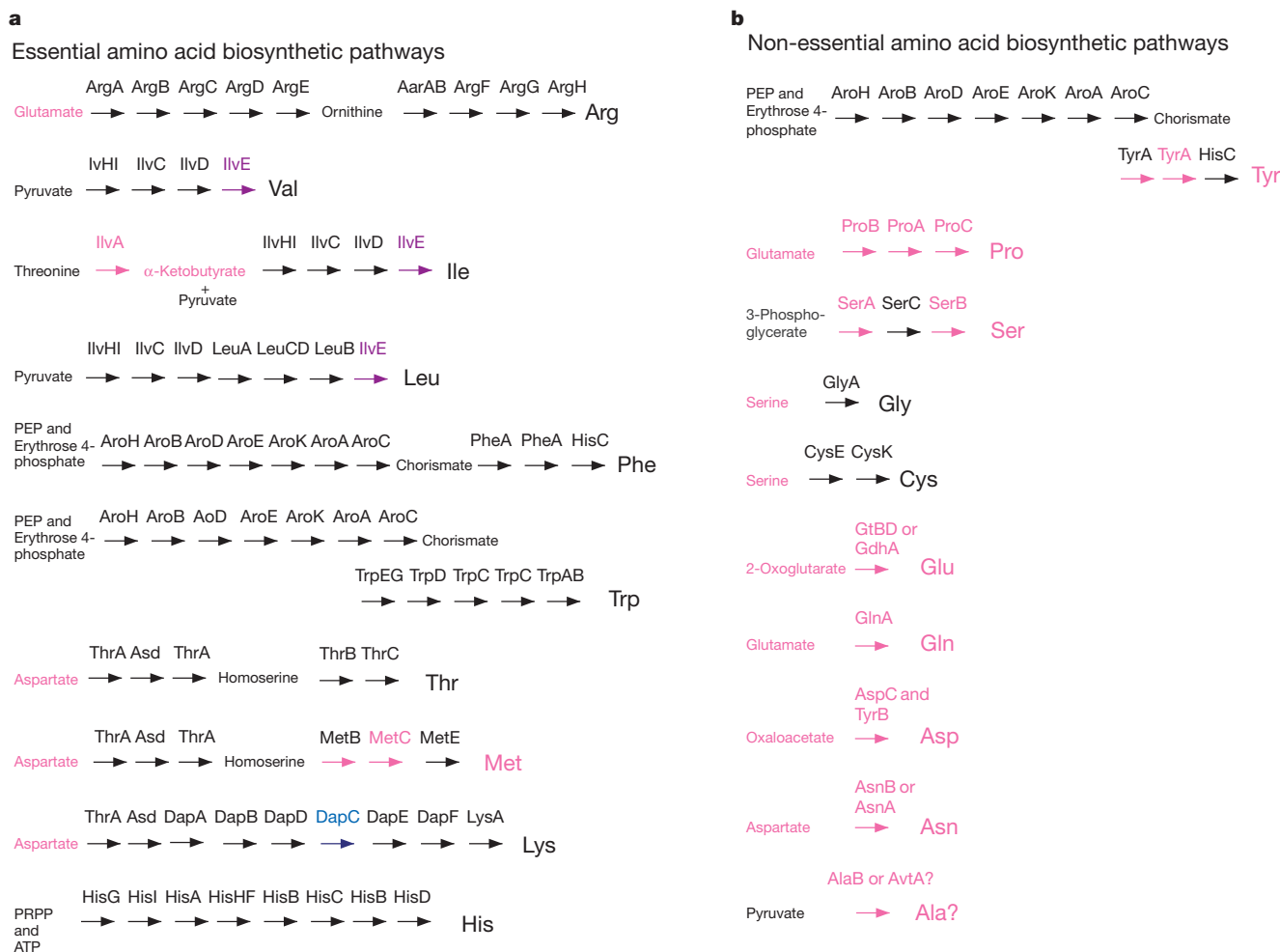
Figure 2 Amino-acid biosynthetic pathways in Buchnera deduced from the gene set. The sequential pathways are represented by arrows, each of which indicates one step catalysed by the named enzyme. The steps for which no genes were found in the Buchnera genome are pink, as are precursors for which de novo synthetic pathways were not identified. a , Essential amino acids of animals. In the valine, isoleucine and leucine biosynthetic pathways, the gene for common enzyme ilvE is absent (purple). ilvE is a

The genome data indicates that Buchnera respire aerobically. This seems reasonable as this bacterium inhabits the bacteriocyte, which receives an ample supply of oxygen through the trachea and contains many mitochondria in the cytoplasm. Buchnera has complete gene sets responsible for glycolysis, the pentose phosphate cycle and aerobic respiration; however, it does not have a gene set for