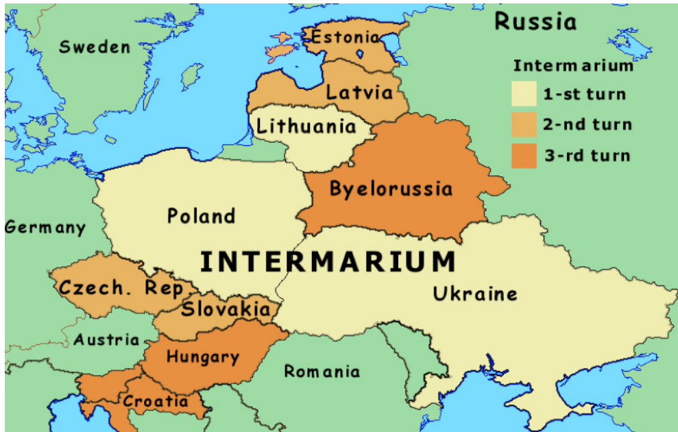
Map 5. Intermarium concept