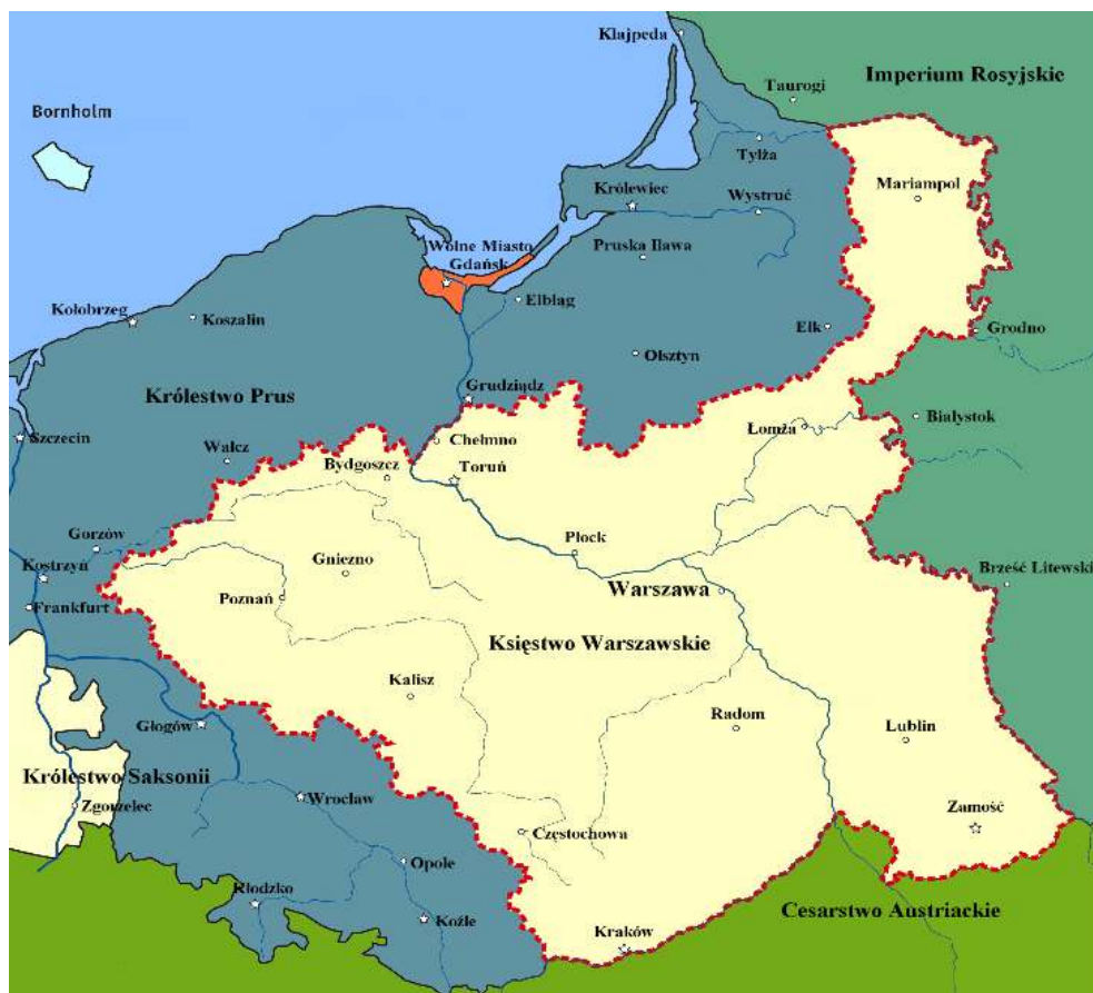
Map 2. The Duches of Warsaw 1807-1815

Source: Księstwo Warszawskie w latach 1807-1809 , Wikipedia https://pl.wikipedia.org/wiki/Ksi%C4%99stwo_Warszawskie