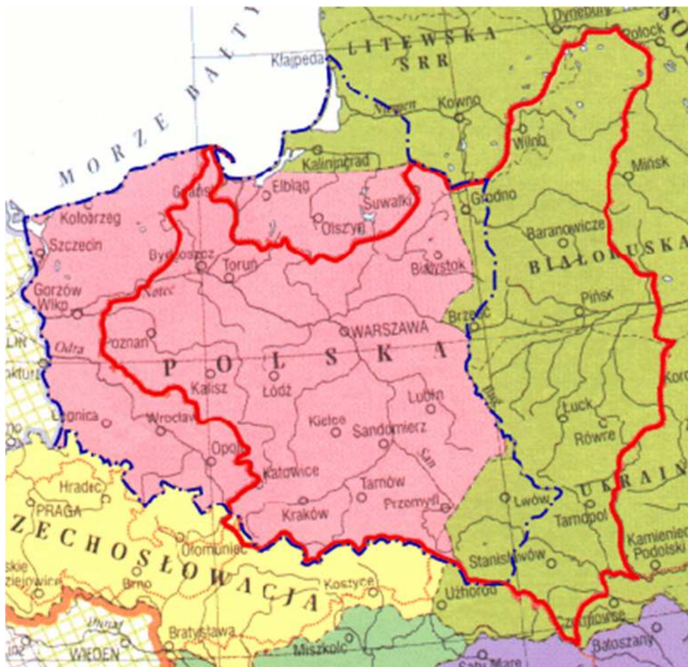
Map 4. II Republic of Poland in comparison to contemporary frontiers