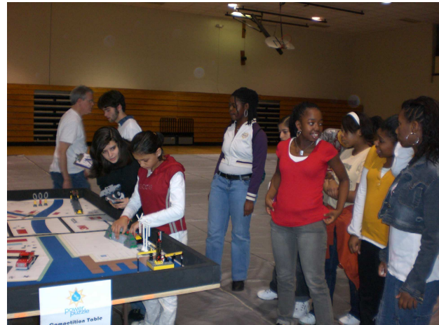
Figure 1: An All-Female, majority African-American LEGO FIRST team, sponsored by "Georgia Computes!" and a first for the Atlanta YWCA TGI-Tech Program.

The results of these activities have been overwhelmingly positive. Tom McKlin is the external evaluator on the team. The Saturday computing workshops are only four hours long; however, despite the short period of time, McKlin found statistically significant improvements in students' attitudes about computing in response to survey questions like "Computer jobs are boring," "Girls can do computing," and "Programming is hard." Of 13 events where we have both pre-surveys and post-surveys, 7 of the workshops had a statistically significant improvement (using Mann-Whitney U-Test, with p < 0.10 ) in participants' attitudes about computing.