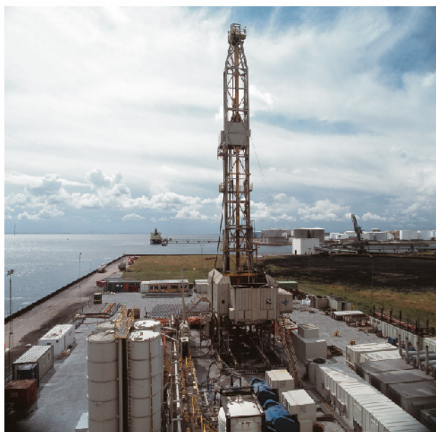
Fig. 3. The drilling of two deep wells at Margretheholm, central Copenhagen.

geological evaluation of the geothermal potential at seven localities in the greater Copenhagen area, based on integration of the new data with existing well and seismic data from Denmark, Øresund and southern Sweden. The evaluation indicated the presence of several possible sandstone aquifers, including the Gassum and Bunter Sandstone Formations. The Margretheholm location close to the centre of Copenhagen was selected for further investigations, and a vertical well was drilled to about 2700 m in 2002 (Fig. 3). The well encountered a promising aquifer in the Bunter Sandstone Formation, and a second, deviated well was drilled to the same aquifer in 2003. The test results were promising, and a geothermal power plant is now under construction based on