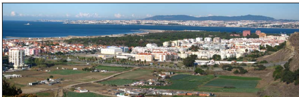
Figure 4. Panoramic view of the northern landscape taken from the Costa da Caparica Fossil Cliff (its termination is on the right side of the picture)

The Costa da Caparica Fossil Cliff Protected Landscape 5 , (N o 5 of figure 1) located on the Setúbal Peninsula, is another protected area that exists in the Lisbon Metropolitan Area, consisting of the steep slope that marks the western coast of the Peninsula Setúbal.