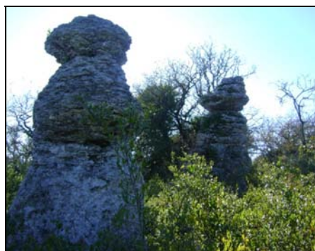
Figure 6. Detail of the Megakarren of the Granja dos Serrões Classified Site

The Classified Site of Zambujal Cave 11 , located in the municipality of Sesimbra (Nº 9 of Figure 1) has a particular speleological and biological interest. The cave was discovered in the 1970's and was quickly recognized for its beauty and rarity of the rock formations found within (figure 3). Similarly, it has been understood the important role that this cavity, included in the Arrábida karst, plays as habitat for several species of cave fauna. The cave contiguous area, also with protection status, witness an ancient and