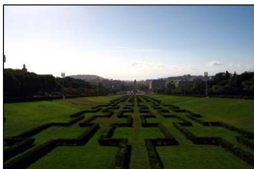
Figure 12. Edward VII Park (upstream sector of the Liberdade Avenue valley) Remark to the left the São Jorge Castle Hill and to the right the Heights of São Pedro de Alcântara

The urban floods related to the problems described above occur naturally at the river mouth of the main valleys that indent the city of Lisbon. However, outside these specific situations of catastrophe for residents and merchants, the valleys preserve its natural beauty; although, only in one of them its occupation was intentionally planned in the frame of the impressive scheme developed by the Marquis of Pombal in order to rebuild the city after the strong earthquake, which combined with a large tsunami, have destroyed the city in 1755. In fact, the area now occupied by the Avenida da Liberdade, which connects the Marques de Pombal Square to Restauradores and Rossio (downtown) (Nº 2 of figure 7), was then transformed in a vast garden with great width (90m, following the wide valley that runs through) taking advantage of the existing water sources to supply fountains and lakes placed among the trees.