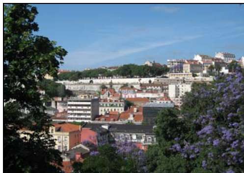
Figure 9. Panoramic view of the city taken from the Torel Garden belvedere

The Tagus river presents at the final sector of its estuary a large alluvial plain dotted with marshes and islets that are included on the Tagus Estuary Nature Reserve, as it can be seen in figure 1. However, this same figure allows also to see that the Tagus river mouth is marked by a narrow passage, called the “ Gargalo do Tejo ” (neck of the Tagus) which is conditioned by tectonics. Thus, from the low and flooded alluvial plain, Tagus river reaches the ocean trough a gorge defined by two steep slopes very well-marked in the morphology: the right bank, in which the old city was built, with the buildings and infrastructures gradually occupying not only the hills and the river bank, but also the actual thalweg through land reclamation (figure 10); the left margin until today slightly urbanized and still maintaining their rectilinear and abrupt appearance (figure 11).