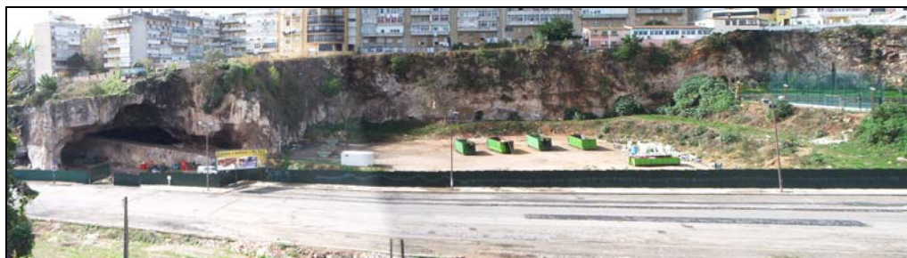
Figure 16. Right slope sector of Rio Seco (Dry River) cutted in compact limestone. This rock was quarried and used as building material and to make lime. The limekiln vestiges turn this area into a geological, geomorphologic and cultural heritage. At present, this area is been partially restored as urban and leisure park

A third example of river incision in the city of Lisbon is the Rio Seco valley (Dry river) which flows from Ajuda quarter towards the Aliança Operária street, and hence to Tagus River (Nº 7 of Figure 7). As well as the downstream sector of the Alcântara valley this is an area of frequent flooding during intense rainfall. When this stream cuts compact limestone the valley presents steep slopes of fluvial-karst canyon type. Figure 16 shows the right margin of the River Seco, cut in massif limestone, explored in quarries and used to make lime. So, there are also some remains of limekiln that makes this area a geologic, geomorphologic and cultural (historic, social and economic) heritage; at present, its left side sector is half abandoned; its right side has undertaken some rehabilitation works that has made it into a small urban park.