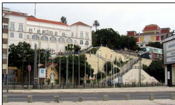
Figure 10. Steep slope of the Tagus right margin, in the Rocha do Conde d'Óbidos area Notice how the stairway allows the communication from the top to the bottom of the slope

The Tagus river presents at the final sector of its estuary a large alluvial plain dotted with marshes and islets that are included on the Tagus Estuary Nature Reserve, as it can be seen in figure 1. However, this same figure allows also to see that the Tagus river mouth is marked by a narrow passage, called the “ Gargalo do Tejo ” (neck of the Tagus) which is conditioned by tectonics. Thus, from the low and flooded alluvial plain, Tagus river reaches the ocean trough a gorge defined by two steep slopes very well-marked in the morphology: the right bank, in which the old city was built, with the buildings and infrastructures gradually occupying not only the hills and the river bank, but also the actual thalweg through land reclamation (figure 10); the left margin until today slightly urbanized and still maintaining their rectilinear and abrupt appearance (figure 11).