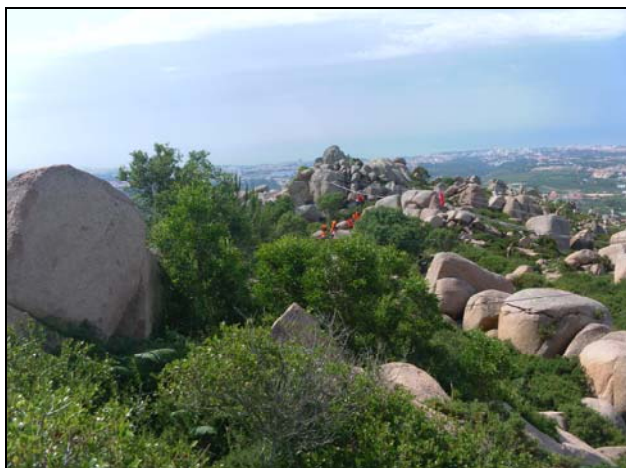
Figure 2. Granite landform (castle koppie) in Sintra Mountain

the dissolution of limestone (karst morphology, figure 3). There are several viewpoints where one can admire the landscape and understand the relationships between the geological structure and landforms. In addition, in some viewpoints along the coastline, it is possible to identify the large escarpments of the coastal cliffs of Cape Espichel and the steep slopes of the southern coast of the Setúbal Peninsula.