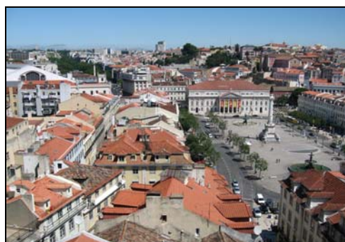
Figure 13. Rossio Square in Lisbon downtown

Remark the green area that occupies the Liberdade Avenue