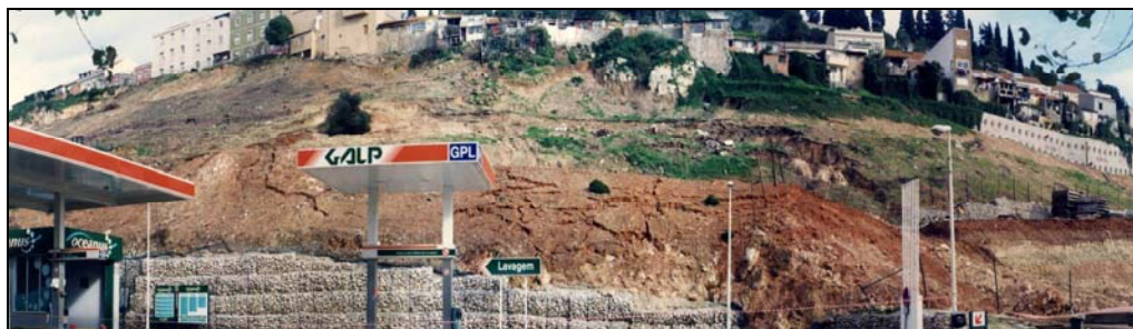
Figure 15. Landslide in the Alcântara Valley

The Alcântara Valley is occupied by major road and rail axis that have been contributing to soil sealing and to enhance urban floods occurring in built-up areas where before stood the river mouth of this stream. The steep slopes of the valley's downstream sector are not suitable for human occupation. So, the right bank is wooded in conjunction with the Monsanto Park (the largest green area of Lisbon, about 1000 ha, forested in the 1940's 13 ); the left slope, that for many years was occupied by a Slum (Casal Ventoso) now demolished, presents clear signs of instability (N o 6 of figure 7 and figure 15).