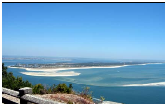
Figure 5. Panoramic of the Sado Estuary viewed from a Belvedere in the ridge of Arrábida Natural Park

These Karren fields, which document the geomorphologic processes that take place at the interface of the atmosphere with the lithosphere and the biosphere, present a shrub and tree cover representative of the spontaneous vegetation of the region and are subject to significant anthropogenic pressures that have contributed to their complete destruction in Negrais by limestone exploration companies. Hence, the need to reclassify, in accordance with current national legislation, the Granja dos Serrões Karren field (figure 6) from classified site to geomonument.