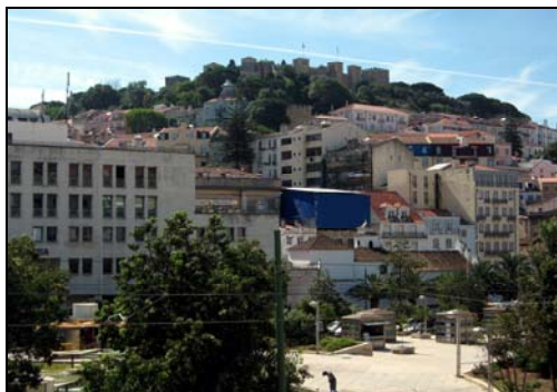
Figure 8. São Jorge Castle Hill view from the floor valley in the Martim Moniz Square