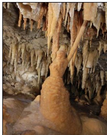
Figure 3. Stalactites and stalagmites (Arrábida cave)