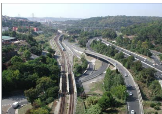
Figure 14. View of the Alcântara River Valley taken from the Águas Livres Aqueduct Remark how the steep slopes are covered, to the right, with vegetation of Monsanto Park, and to the left, with some houses. The valley floor hides the stream and its surface becomes impermeable due to the occupation by roads and railways. On the background it is possible to see the hills of Tagus left margin

Another valley well marked in the urban landscape is the valley of Ribeira de Alcântara with about 12km in length and a catchment area of around 35km 2 (N o 5 of figure 7). The upper section starts at Brandoa (in the neighbour municipality of Amadora) and it is called Ribeira da Falagueira (which still runs in open air), than the name changes to Ribeira de Benfca, in the area of the same name (in this section the valley is occupied by the Sintra railway), and it joins the Ribeira do Lumiar becoming the wide valley of the Ribeira de Alcântara (figure 14) that is crossed by the Águas Livres Aqueduct; this aqueduct was built in the mid-eighteenth century, to supply water to Lisbon, and it has withstood the 1755 earthquake.