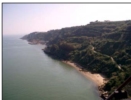
Figure 11. Steep slope of the Tagus River left margin Notice how this bank is relatively free of constructions

With regard to the valleys that, going through the city of Lisbon, incise the right bank towards the Tagus, its artificial channelling never stopped raising hydrologic problems in the city. In fact, all the tributaries of this right margin have a hydrologic regime featured by the occurrence of flash-floods, which is associated with very short stormwater time of concentration, in periods of intense and concentrated rainfall; this heavy precipitation may occur between November and March. These times of concentration have decreased significantly and proportionally to the urbanization of their watersheds, as shown by studies in the tributaries of the right bank located at the west of the city of Lisbon until Cascais. This is naturally associated with increasing soil sealing as a result of the buildings and streets, joining the other ever-present factor in this entire