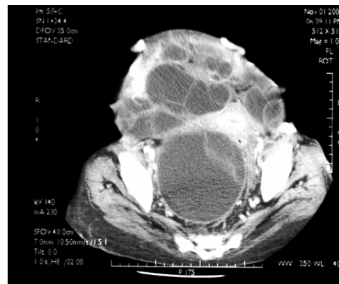
Figure 2 Enhanced CT of the Abdomen. Multiple well defined mesenteric cysts with septae