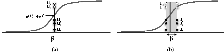
Figure 1: The relationship between \beta_1 , z and u in a simple model with a single document and two topics. (a) Given \beta_1 , if z_n = 1 , u_n (represented by a black dot) must fall below the value of the logistic CDF at \beta_1 . Otherwise, u_n (represented by a white dot) must fall above the value of the logistic CDF at \beta_1 . (b) Given u , \beta_1 can be anywhere in the interval defined by the maximum black dot and minimum white dot.