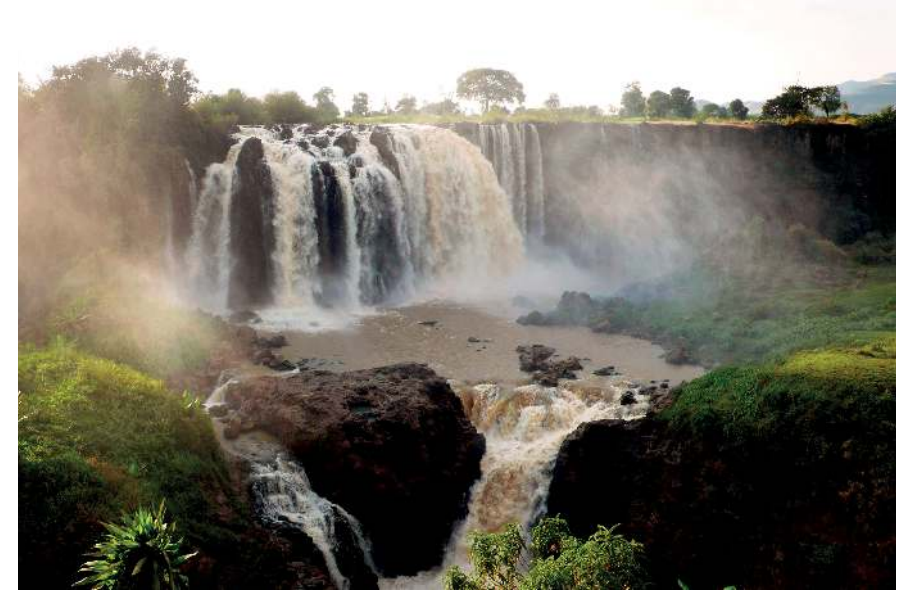
Ethiopia's highland waterfalls, where the Blue Nile begins.

Sharing data with researchers without compromising user privacy required new infrastructure. Social Science One and Facebook built a secure portal that connects to Facebook's servers and uses a mathematical technique known as differential privacy, which adds noise to the results of analyses that prevents users from becoming personally identifiable. Social-media data, although less sensitive than medical information, bring extra privacy challenges because they are connected to a person's real-world behaviour, so even if they are anonymized, it is relatively easy to identify individuals, says Jake Metcalf, a technology ethicist at the think tank Data & Society in New York City who is on the team conducting ethical reviews for proposals to the scheme. "It's a very challenging model to achieve," he says. ■