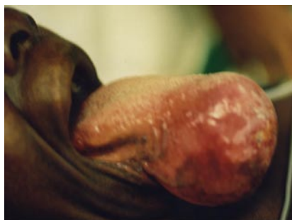
Fig. 1. Profile view of patient showing tumor at the tip of the tongue and uninvolved tongue.

Under general anesthesia a longitudinal incision was made over the mucosa covering the tumor at the tip of the tongue. Blunt dissection was used throughout. The tumor literally popped out from underneath the mucosa, reminiscent of popping out of the buccal fat pad after breach of its capsule (Figure 2). There was no involvement of the tongue musculature. The tumor was yellowish in color and well encapsulated (Figure 2). The mucosal layers were closed together with absorbable sutures obliterating the dead space. She made an uneventful recovery from the surgery (Figure 3).