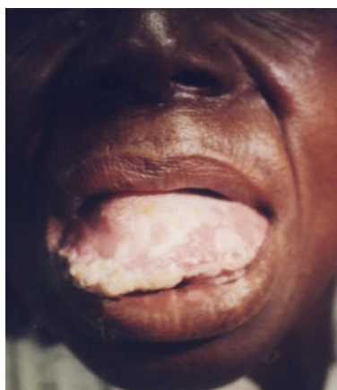
Fig. 3. Appearance of tongue 4 days postoperatively.

Macroscopic examination showed a single mass of tissue covered with adipose tissue, 80mm x 80mm x 50mm and weighing 38 grams. The cut surface showed fatty tissue.