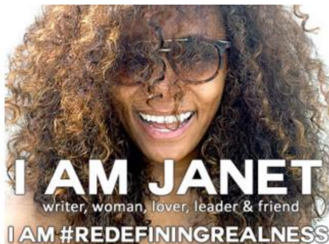
Figure 6: Janet Mock Tumblr post

Mock began the social media initiative with a selfie that read, “I AM JANET writer, woman, lover, friend I am #REDEFININGREALNESS,” (I AM #RedefiningRealness, n.d.). A notably diverse group of users submitted to the Tumblr site for nearly ten months with over 120 unique contributions. The hashtag encouraged users to say more about themselves than their gender or sexuality, centering their humanity and various social and relational roles. Much like the community-building and celebrating functions of #GirlsLikeUs, contributors discussed their jobs, their favorite qualities about themselves, and their hopes for the future. The use of the hashtag #RedefiningRealness quickly moved to Twitter where it is used by trans and queer users to describe ways in which they are redefining gender, fans of Mock’s posting selfies with the book, and in Mock’s own tweets logging her nationwide travels to promote the book and related projects.