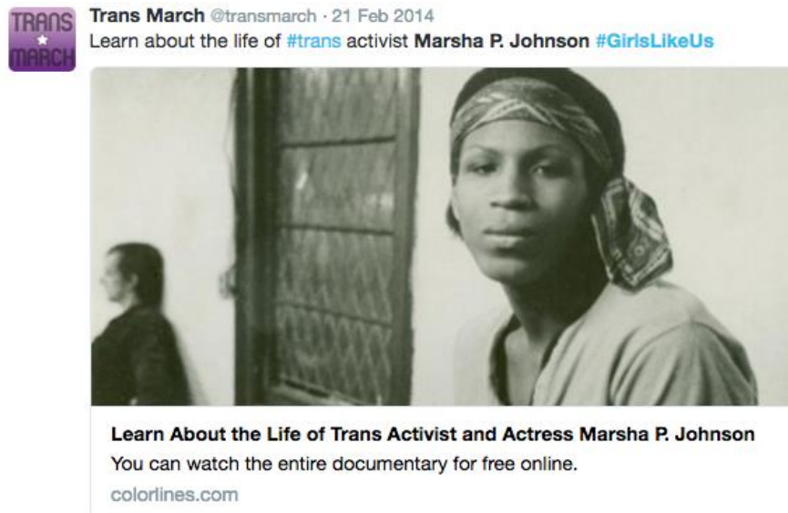
Figure 2: Trans March #GirlsLikeUs tweet about activist Marsha P. Johnson

Tweets in this category also work to connect issues of trans liberation to intersectional concerns of poverty, racism, and sexism. For example, Janet Mock connected the case of CeCe McDonald to that of Trayvon Martin, the Black Florida teenager killed by neighborhood watchman George Zimmerman. By using the hashtag #JusticeforTrayvon alongside #GirlLikeUs and #FreeCeCe, Mock discursively works to illustrate the connection between anti-Black violence and trans identities often left out of conversations on racial profiling. At the same time, Mock makes the issue of anti-Black violence, one too often excluded from the mainstream LGBT movement, central to her brand of trans advocacy.