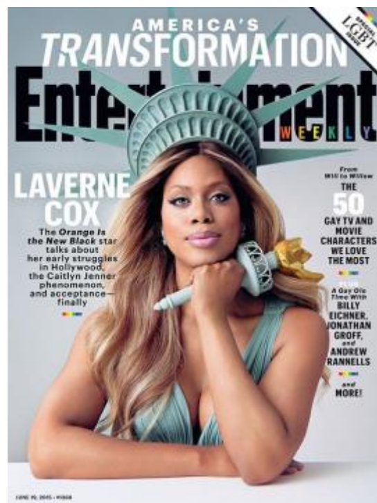
Figure 7: Laverne Cox as Lady Liberty

The depiction of Laverne Cox, a Black trans woman known primarily for playing a prisoner as Lady Liberty, one of the most beloved American political and cultural symbols, on the cover of Entertainment Weekly's first ever “LGBT Issue” speaks to the interventionist power of #GirlsLikeUs. Black trans women and their political frameworks have not only become the face of trans issues, but of LGBT issues, and the nation as a whole, a representation few could have imagined in 2012 when #GirlsLikeUs began. 7