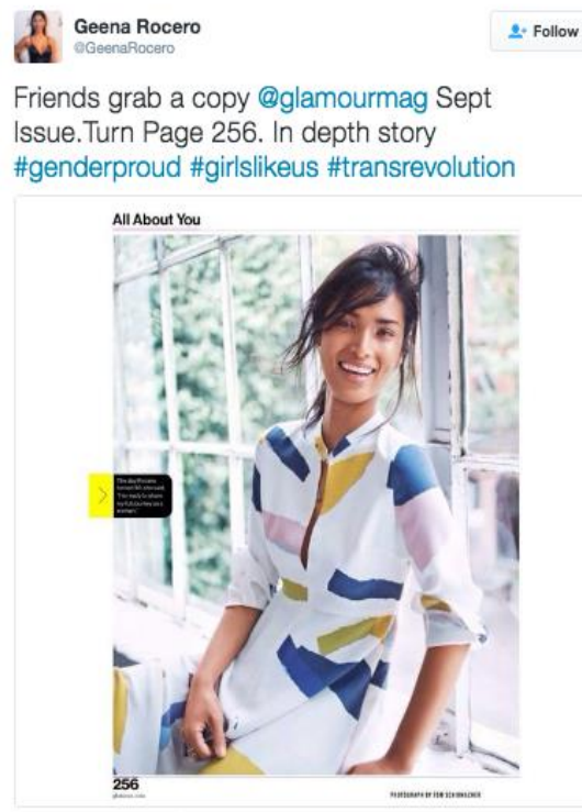
Figure 4: Geena Rocero tweets about her Glamour magazine profile with #GirlsLikeUs #GenderProud and #TransRevolution

community-building narratives that highlight the rise and accomplishments of trans women. For example, trans model Geena Rocero publicized a photoshoot in Glamour Magazine using #GirlsLikeUs alongside the hashtag for her own trans advocacy organization Gender Proud, and the hashtag #TransRevolution. Here, we see Rocero connecting her accomplishments as a trans women and public personality - a profile in a mainstream women's magazine - to trans advocacy work offline and to the digital community constructed through #GirlsLikeUs. As is common in the #GirlsLikeUs network, Rocero's tweet was responded to with words of encouragement, including from Janet Mock who replied, "gorgeous + glowing! Can't wait to pick up my copy! #genderproud #girlslikeus," (Mock, 2014b).