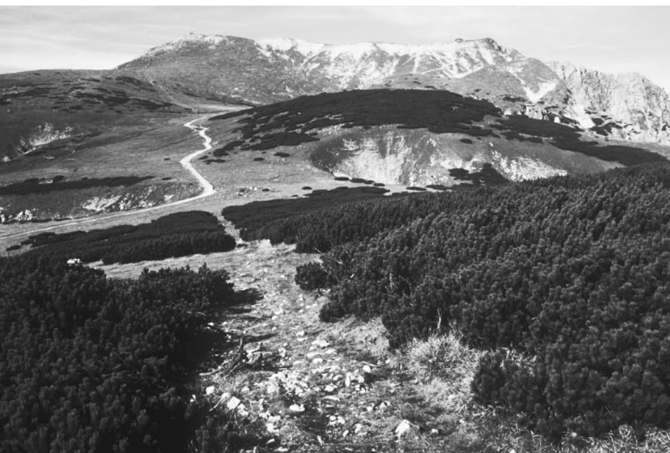
FIGURE 3 The plateau of Mount Schneeberg, showing a particularly disintegrated treeline. Due to summer pasturing, a pattern of krummholz, pasture grasslands on flat sites and natural vegetation in dolines (center and center left), is established. The summit in the background forms a ridge with grassland, scree, and snowbed vegetation as well as rocks on its slopes.

(LAI), and the aerodynamic conditions in and above the canopy, as well as soil water potential and saturation deficit, are important factors that control the transpiration process. A considerable number of catchment studies have been carried out in recent decades in Europe, but they have often produced conflicting results. Nevertheless, the following basic conclusions can be drawn: