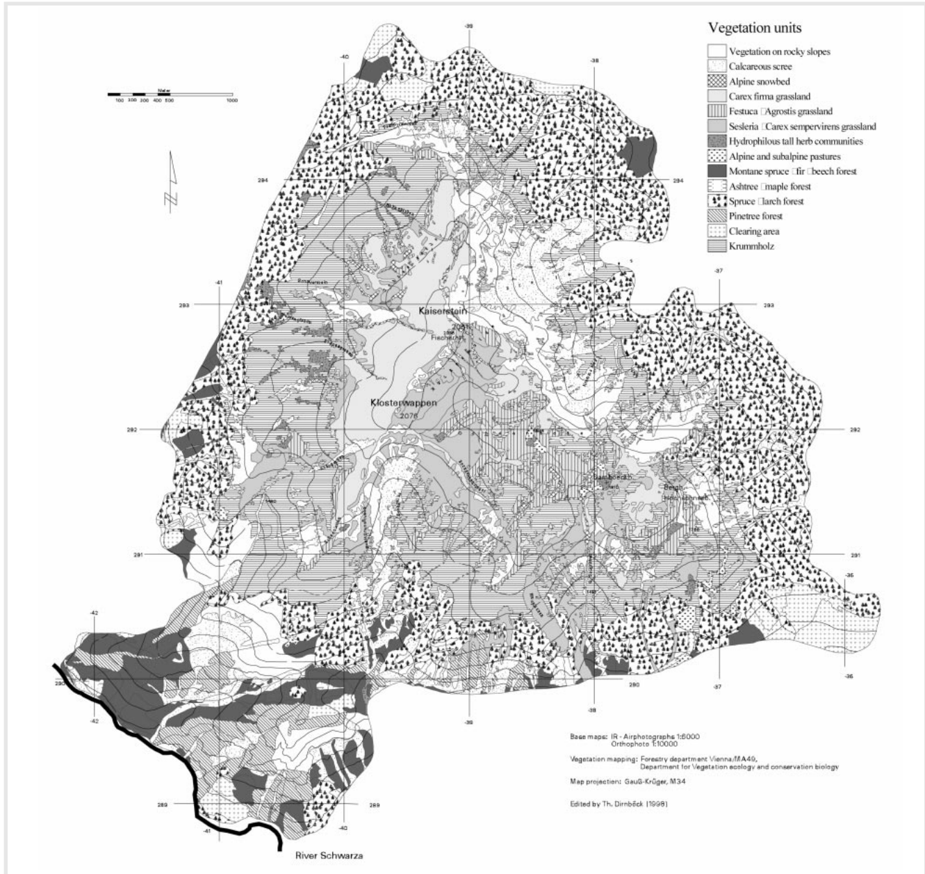
FIGURE 2 Vegetation map of the investigation area.

forest soils are very shallow. Dystric Cambisols were also found on some sites where acidic rock occurs.