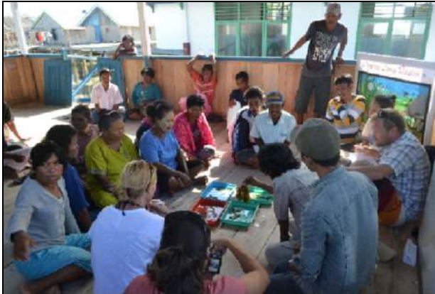
Pic 1. Workshop with Bajo (sea gypsy) fisher folk in the Wakatobi National Park that identified threats to, and changes in seagrass area.