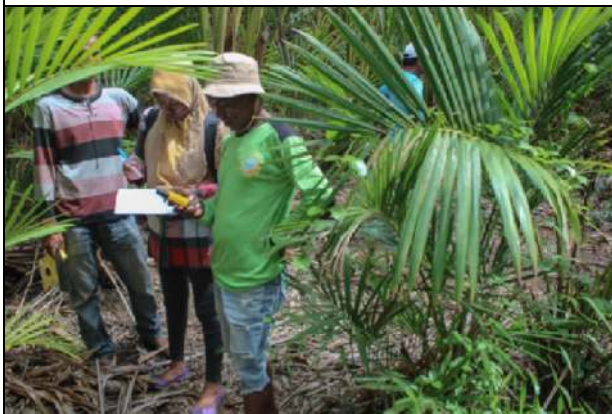
Pic 3. Members of community NGO, FORKANI, conducting river mapping in preparation for riparian restoration using fruit trees.