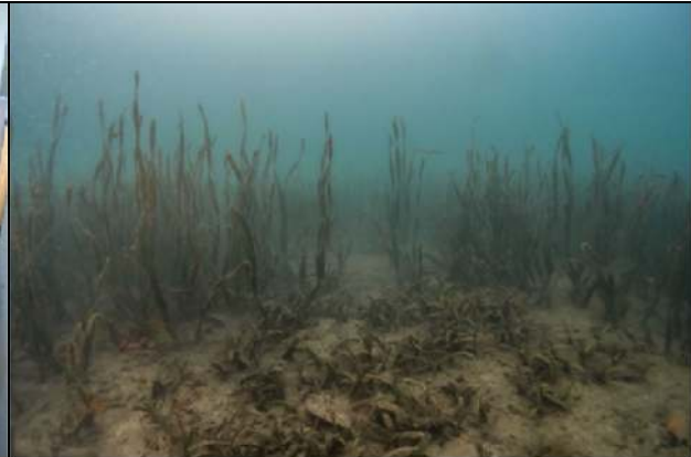
Pic 2. A highly degraded seagrass meadow within the Wakatobi National Park. Sedimentation has resulted in species succession to an Enhalus -dominated ecosystem.