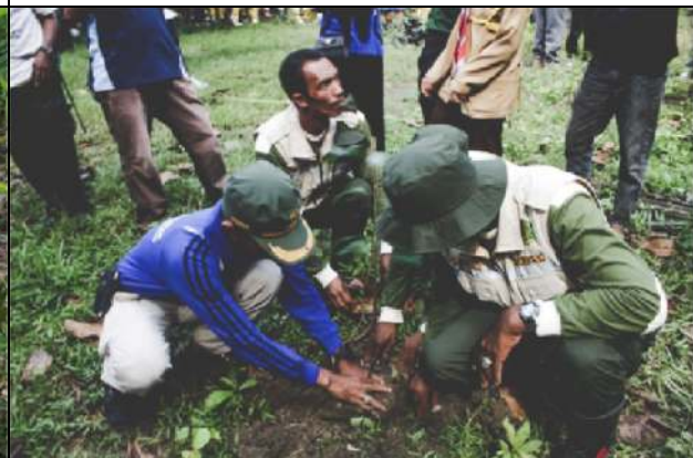
Pic 4. Community tree planting event engaging village leaders, the general public, and government officials.