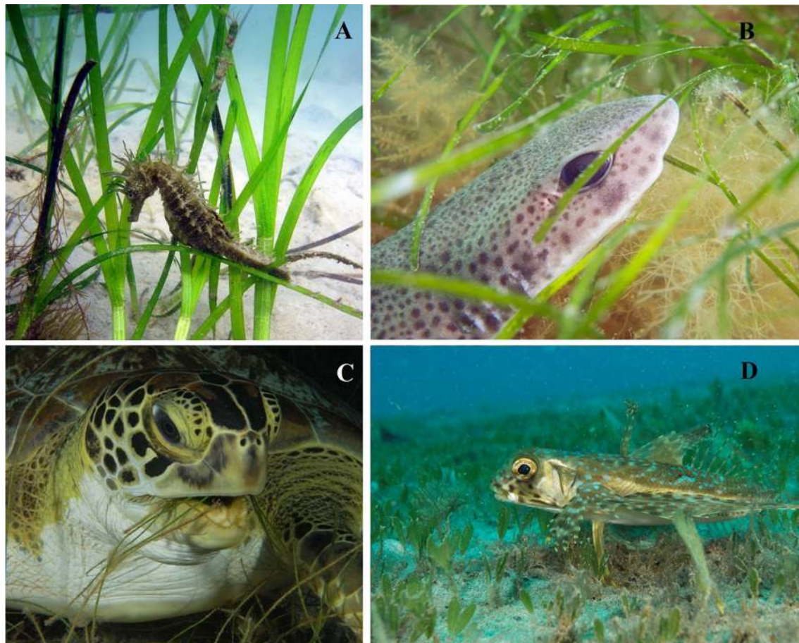
Fig. 1 Seagrass meadows are beautiful habitats containing biodiverse faunal communities such as the following a the Spiny Seahorse ( Hippocampus guttulatus ) in the UK, b Dogfish ( Scyliorhinus canicula ) in the UK, c the Green Sea Turtle ( Chelonia mydas ) in the Dutch Antilles and d Flying Gurnard ( Dactylopterus volitans ) in Puerto Rico

or condition exists from which reference baselines can be established. Temporal data on seagrass extent are limited to sub-regional scales, for example in Denmark where nationwide records extend for over a century (Riemann et al. 2016) and NE Australia and the western Mediterranean where only scattered decadal-scale observations are available (Rasheed and Unsworth 2011). The adoption of seagrass as a robust indicator of the health of coastal ecosystems in programmes such as the EU Water Framework Directive (Roca et al. 2016), the Chesapeake Bay (US) Program (IAN 2017) or Australia’s Great Barrier Reef Water Quality Protection Plan (McKenzie et al. 2012) have created platforms for sustained monitoring across sub-regions, but such programmes are scarce and in some cases require improvement. A significant gap in such monitoring is within developing countries that often do not have the financial resources necessary for such monitoring