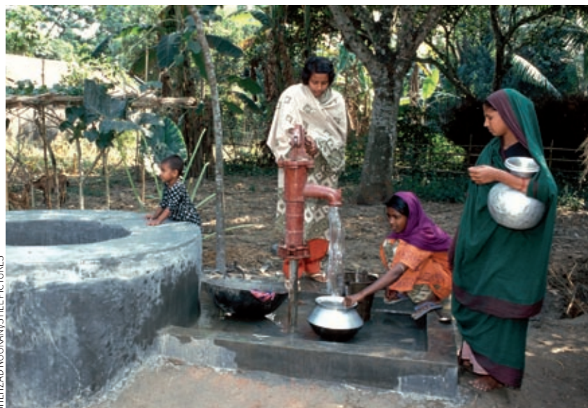
Fig 1 | Although installation of wells in Bangladesh has reduced diarrhoeal disease, contamination with naturally occurring arsenic jeopardises the safety of both drinking water and food. This hand pump has been painted red to show contamination, (clean wells are painted green)

The health effects of global environmental change will vary between countries. Loss of healthy life years in low income African countries, for example, is predicted to be 500 times that in Europe. The fourth assessment report of the Intergovernmental Panel on Climate Change concluded that adverse health effects are much more likely in low income countries and vulnerable subpopulations. These disparities may well increase in coming decades,