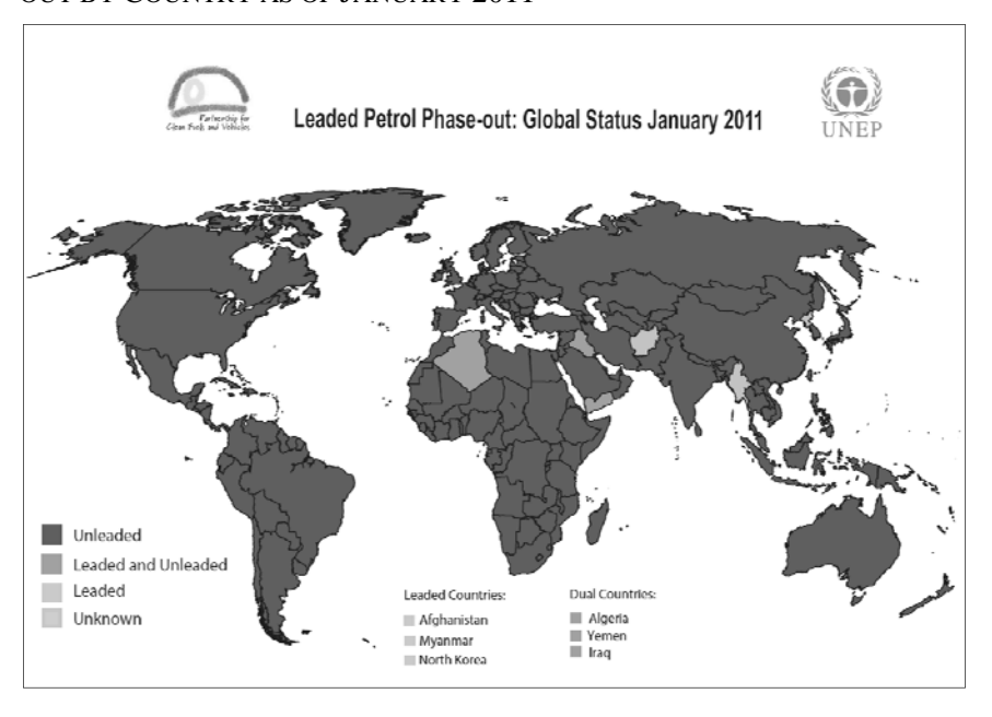
FIGURE III. MAP SHOWING STATUS OF LEADED GASOLINE PHASE-OUT BY COUNTRY AS OF JANUARY 2011

triumphs for the EPA in the agency's more than four decades of operation. As indicated in the map below, which was prepared by the United Nations Environment Programme, today nearly all countries have phased out the use of leaded gasoline. Notwithstanding the handful of countries that still permit its use, leaded gasoline is a powerful example of how a global norm can arise without the need for a multilateral environmental agreement seeking to mandate its adoption.