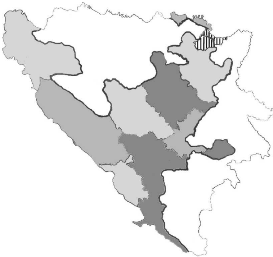
Insert (Map 1)