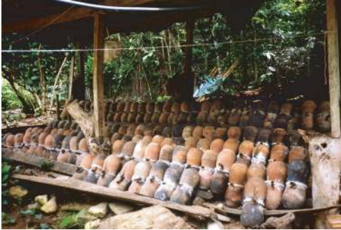
Figure 2. Clay Hives of Scaptotrigona mexicana used by native people in Puebla, Mexico.