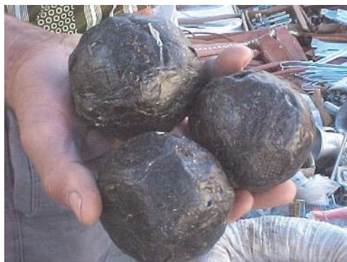
Figure 4. Balls of cerumen sold in street fair in the Northeast of Brazil.

The extraction of honey is often the sole income for keepers of stingless bees, followed by cerumen (Fig. 4) and resin, but a few years ago, commercial use of stingless bees in pollination began. In all Latin American countries,