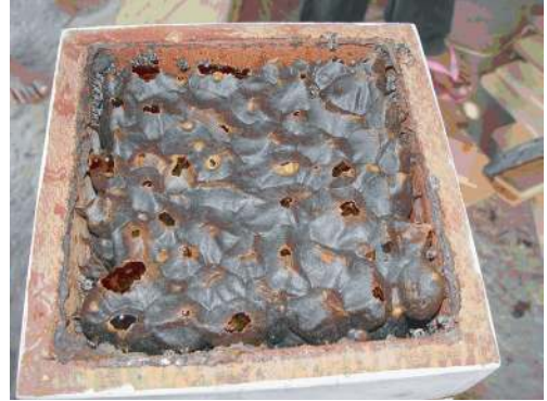
Figure 3. Tray of honey pots from Melipona compressipes fasciculata ready to be collect.

(1997), have been modified by beekeepers. Modifications have also been made in hive volume, adapting them for the size of each rearing species. Ceramic clay hives (Fig. 2) are still used by indigenous people in Mexico as well as by some traditional populations in Brazil (Castro, 2005). Mud is often used to close the logs and rudimentary hives in the field, after management, to prevent enemies from entering the nest (primarily phorid flies and ants).