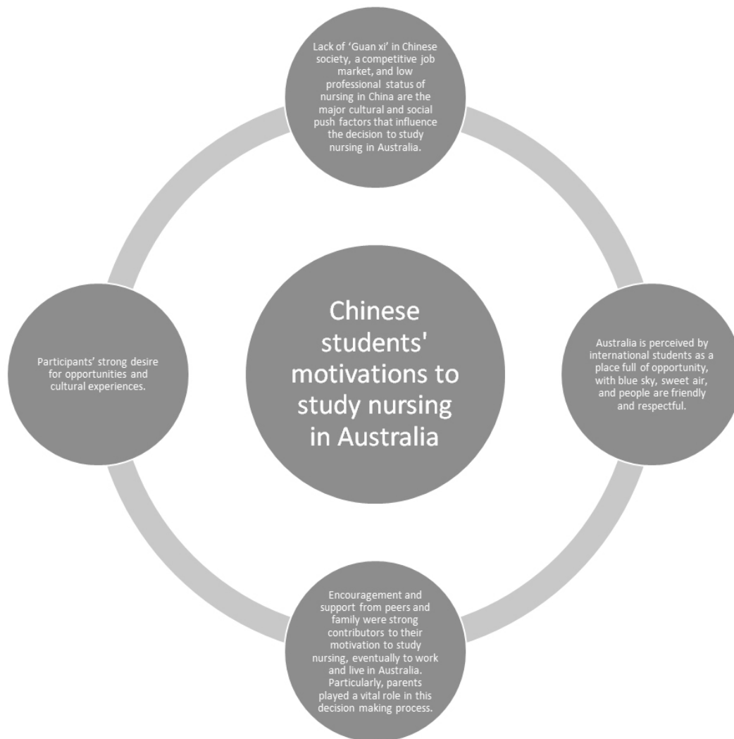
Figure 1. Four themes relating to the decision to study in Australia

All six participants completed their nursing degree in China prior to attending an Australian university. The factors related to the move to Australia were encompassed in four themes (see Figure 1): cultural and social ‘push’ factors in China, Australian ‘pull’ factors, encouragement and support from peers and family, and participants’ strong desire for opportunity and cultural experiences.