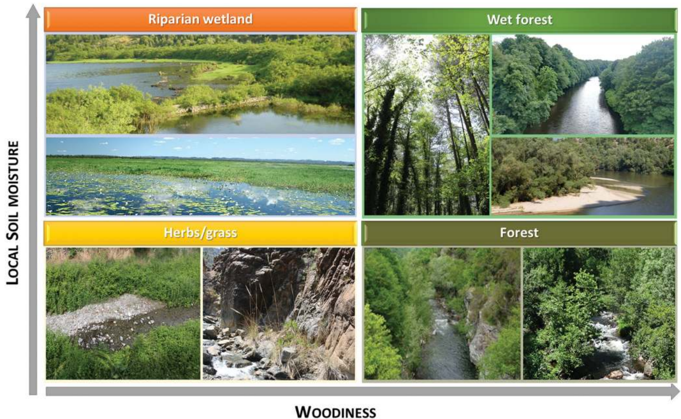
Figure 2. Diagram showing the four main riparian vegetation types structured along two main factors: cover of wood and local soil moisture.

and, second, to synthesize the knowledge on these ES from the literature. On the basis of the structured approach, we introduce a guided framework for use in riparian vegetation management. We also seek to identify key knowledge gaps and conclude the article by evaluating the opportunities an ES approach offers to riparian vegetation management and restoration.