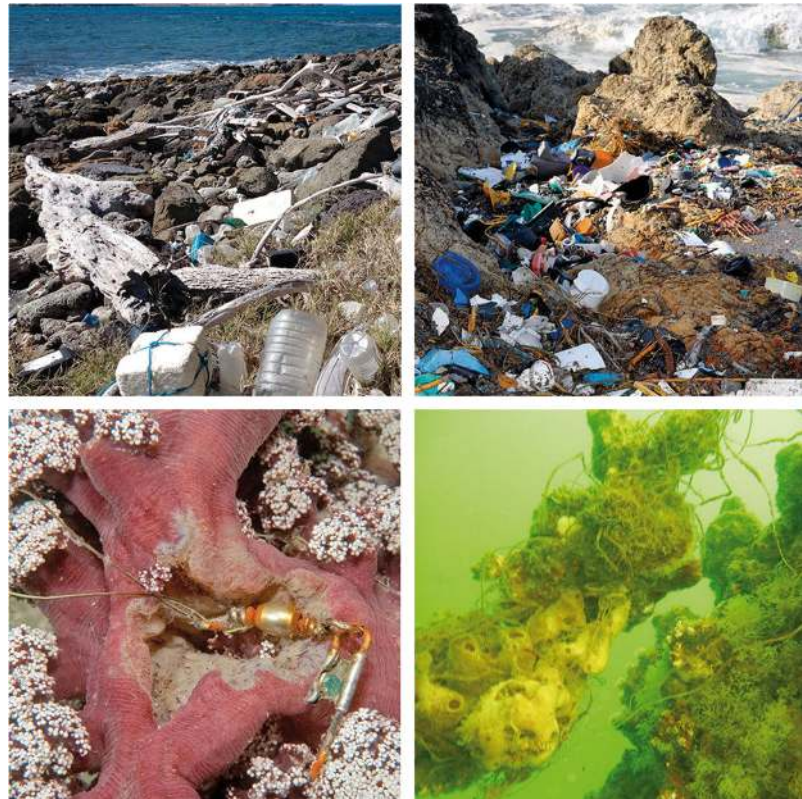
Fig. 2. Clockwise from top left—beach debris from a remote beach on Catholic Island, Grenadines (courtesy Jennifer Lavers); debris accumulation on an urban beach (Stradbroke Island, Australia) (courtesy Kathy Townsend); entanglement and damage to soft coral by fishing line (courtesy Stephen Smith); and fishing line entanglement of a pier with algae and sponges growing on it (courtesy Kathy Townsend)

Quantifying the impact of plastic pollution on the physical condition of habitats has received little attention (but see Votier et al. 2011, Bond & Lavers 2013, Lavers et al. 2013, 2014) relative to the impacts of plastic pollution on organisms (e.g. Derraik 2002, Gregory 2009). However, in intertidal habitats, accumulation of plastic debris has been shown to alter key physico-chemical processes such as light and oxygen availability (Goldberg 1997), as well as temperature and water movement (Carson et al. 2011). This leads to alterations in macro- and meiobenthic communities (Uneputtu & Evans 1997) and the inter-