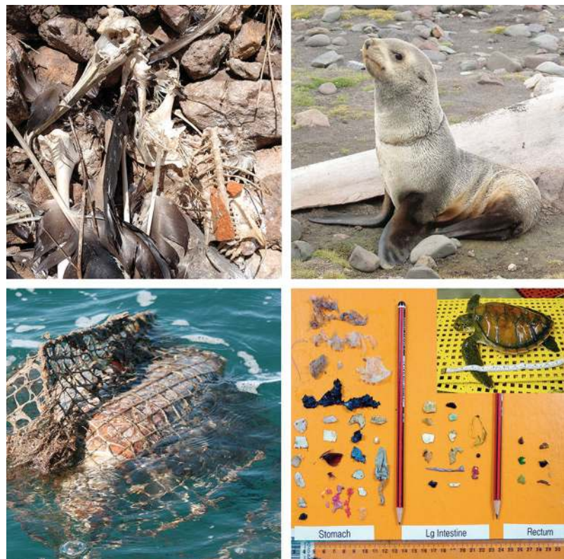
Fig. 3. Top left to bottom right — magnificent frigatebird Fregata magnificens carcass from Battowia Island, Grenadines, with orange foam contained within stomach; Antarctic fur seal Arctocephalus gazella , with plastic ring entanglement at King George Island, Antarctica; juvenile green turtle Chelonia mydas trapped in discarded crab trap and plastic fragments recovered from the gut of a juvenile green turtle

When taken in conjunction, it is clear that plastic pollution is impacting food webs through ingestion