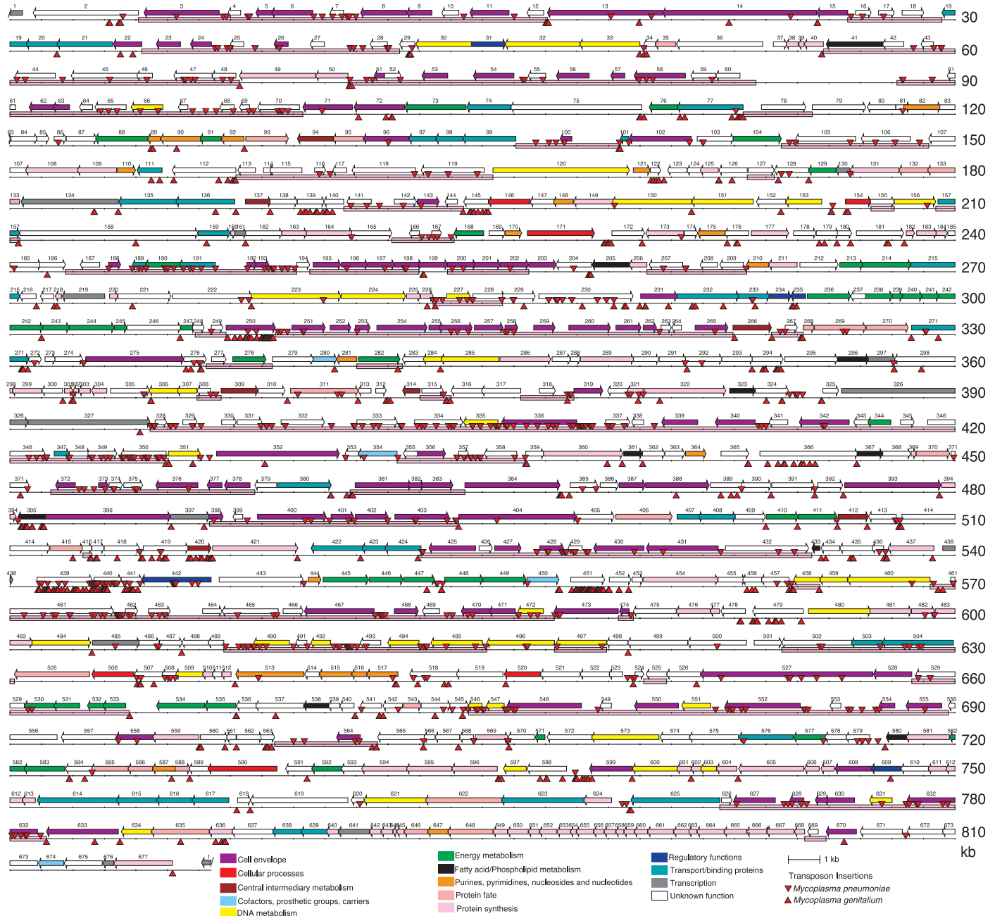
Fig. 1. Viable transposon insertions displayed on a composite M. pneumoniae - M. genitalium map. The M. pneumoniae genome is shown at a scale of 30 kb per line. Colored arrows above the line indicate annotated genes. Genes are colored according to their functional category, as indicated in the key. The genes are numbered sequentially from 1 to 677 as listed on Richard Herrmann's Web page ( http://mail.zmbh.uni-heidelberg.de/M_pneumoniae/genome/Sorted_Genes.html ) and are referred to in the text as MP001 to MP677. Red triangles below the line indicate positions of transposon insertions documented in M. genitalium , mapped onto the M. pneumoniae genome (20). Red triangles above the line indicate positions of transposon insertions documented in M. pneumoniae . Regions of the genome that are M. pneumoniae -specific (absent from M. genitalium ) are highlighted in pink directly on the line (20).

Relatively few M. genitalium genes have functions related to biosynthesis and metabolism. This limited metabolic capacity has been compensated for by a proportionately greater dependence on transport of raw ma-