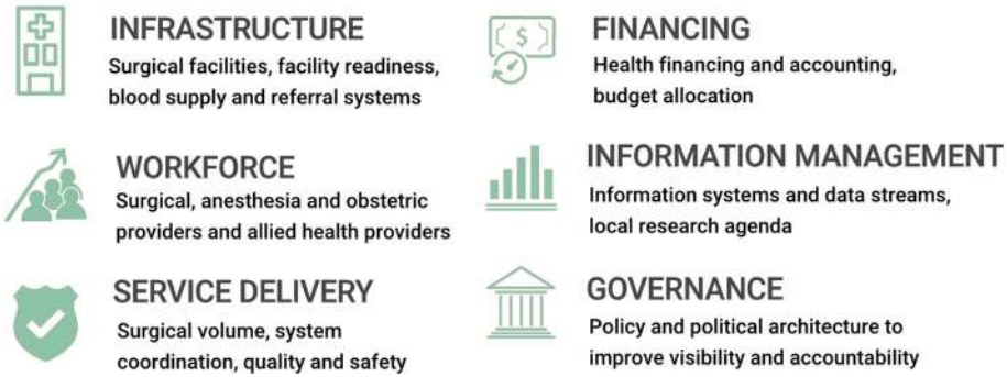
Fig. 1 NSOAP development includes a complex framework of components that are often developed in parallel. These are not prescriptive, but flexible and adaptable to the local context of each countryGlobal Distribution of NSOAP Plans

The 6 component framework is a modification of the original Lancet Commission on Global Surgery (LCoGS) 5 component framework. Governance has been added as the sixth component.