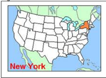
Figure 1. New York State