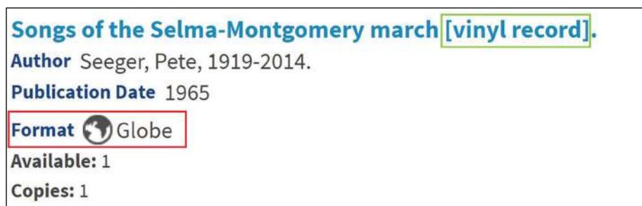
Figure 5. Example of Title with Display Icon for Globe and GMD “vinyl record”

exist in one bibliographic record, catalogers must identify the 007 field that corresponds to the primary item type in hand and revise the order of the 007 fields to list the primary 007 field first. By reorganizing the 007 fields to list the primary item type as the first 007 field, the OPAC display generates the appropriate icon for an item type.