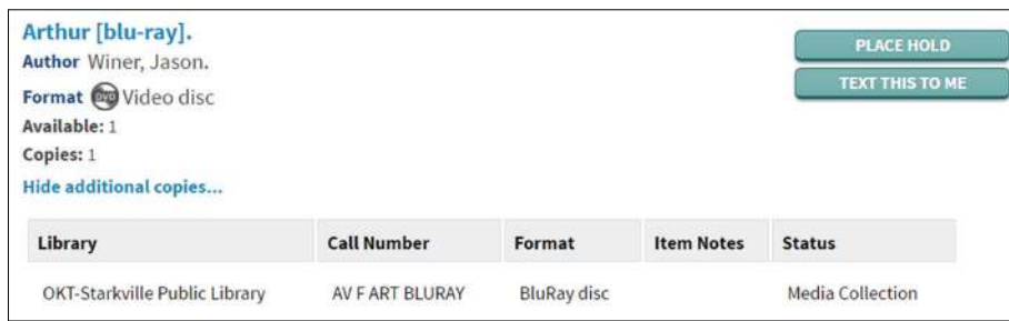
Figure 1. Example of GMD that Clarifies Format Icon Information

user convenience. MSU's cataloging and computer systems departments moved forward with RDA enrichment and implementation.