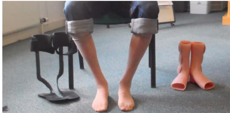
Fig. 1 Distal muscle weakness in a GNE myopathy patient

of the quadriceps [2]. Notably, the presentation of strong quadriceps in spite of major involvement in other leg muscles is still the best clinical signpost for the diagnosis of GNE myopathy as it is rarely found in other neuromuscular disorders [3].