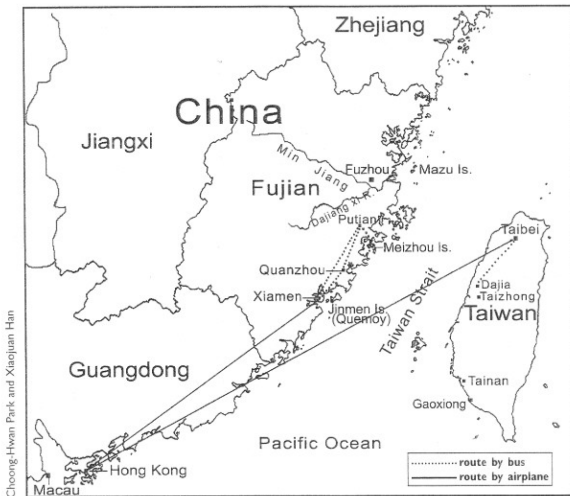
Map of Mazu Pilgrimage from Dajia, Taiwan, to Meizhou Island, Fujian Province, July 2000

I conducted fieldwork on popular religion and media development in Taiwan for four months in 2000 and 2001 and traveled with Dongsen Television News Station (ETTV News) from Taiwan to China in July 2000, observing their reporters and technicians deliver live satellite television coverage of the historic