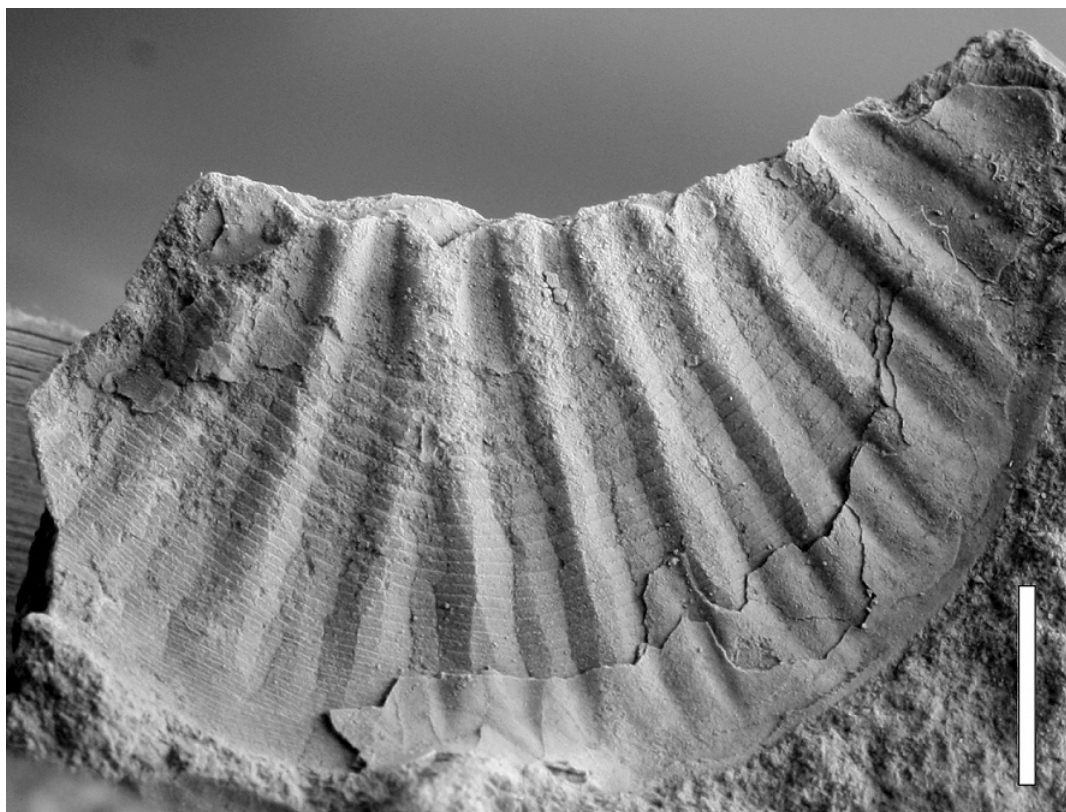
Figure 3. Pygidium of Scabriscutellum sp. A (NHMM 2009082) from the Foulerie Member of the Couvin Formation (lower Eifelian) in Nismes. Scale bar represents 5 mm.

Conversely, the pygidial median rib of these taxa is usually broad proximally.