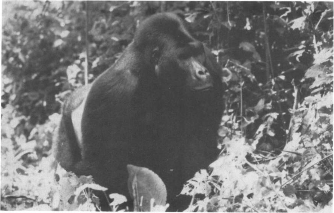
A silverback (C. and R.J. Aveling).

resources, setting up systems that will continue after the withdrawal of such assistance. Since establishing the gorilla tourism system the expatriate personnel have gradually withdrawn from its operation and concentrate most effort on developing other aspects of the project. The gorilla guides and trackers trained by the project have given on-the-job training to new guides taken on by IZCN, and two of the four gorilla families were habituated by guides and trackers themselves after training in approaches and techniques.