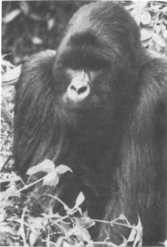
A male mountain gorilla.

been pointed out, it is very important that this area be better protected.