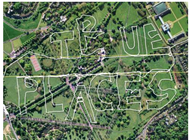
Figure 2. Meridians , 2005. Detail of 'true places' drawn in Greenwich Park, home of internationally standardized time. Image courtesy of the artist

Originally, this locale only had two benches. For this work, Wood placed a GPS receiver on each of these and checked their position every 10 s for the duration of 1 min. These successive locations were assembled into a picture of where the international positioning infrastructure said they were. Twelve new park benches were then precisely placed according to