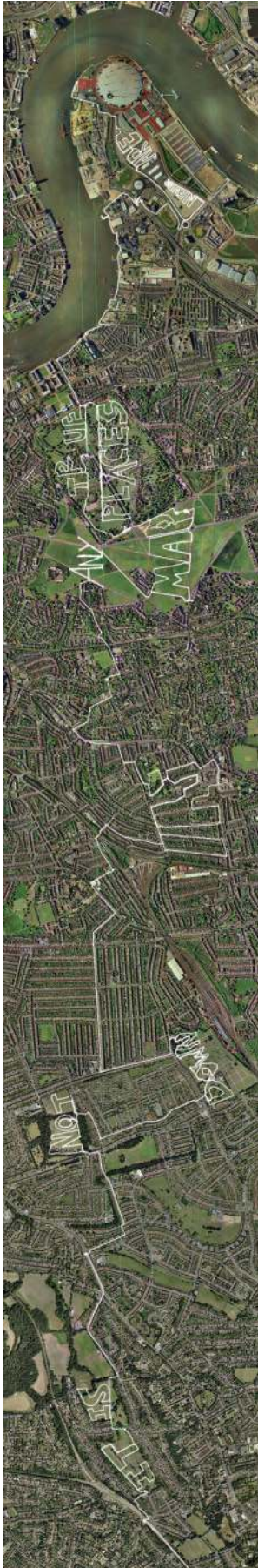
Figure 1. Meridians , 2005. 'It is not down in any map; true places never are', Moby Dick , Herman Melville. GPS Drawing along two meridians over London.

movement and process. Just like a pencil drawing where smooth lines have a different speed to jagged edges, GPS drawings can detail the elegant lines of a railway and a squiggly walk to the local shops. As a pencil can momentarily pause in its progression, we might hesitate or wait before crossing a road. The speed of travel can also be coloured to indicate the cold blues of slow dithering to red hot top speeds, and the altitude of tracks can add pressure and depth of line. (Wood, 2008)