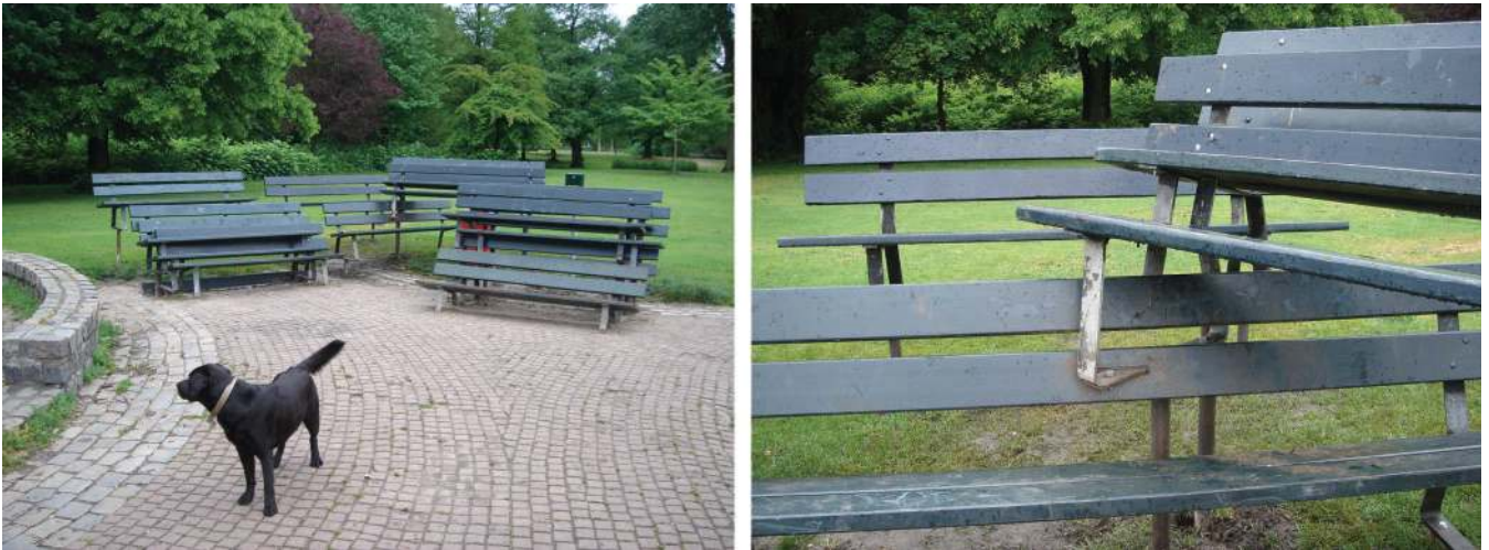
Figure 3. Data Cloud , 2008. A sculpture of where GPS technology thinks it is. Beatrixpark, Amsterdam.

where the GPS technology positioned them on top of and beside the original two existing benches (Figure 3).