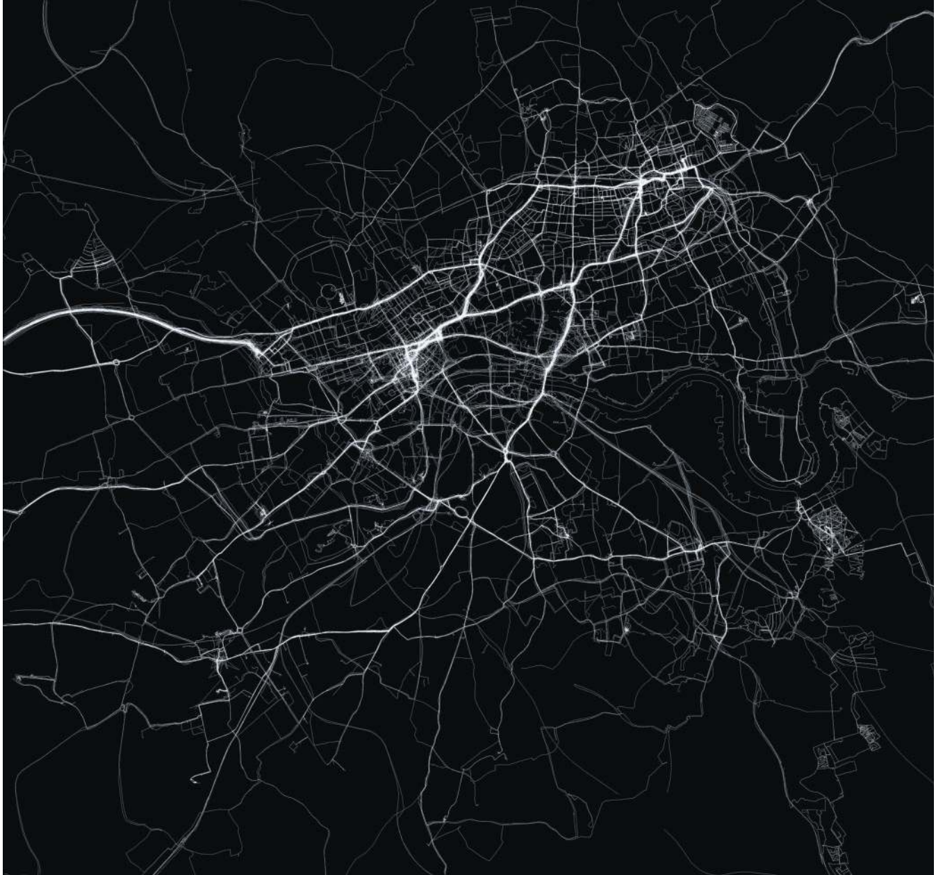
Figure 5. My Ghost: London 2000–2009. Personal cartography with GPS in London.

angles. The land shapes where he can mow and the act of mowing is shaped by his use of GPS, in the same way that it has changed the way he treats all his journeys (Wood, 2008a). In GPSdrawing.com, we find 5 years worth of mowing the lawn drawings. The act is performed at an average speed of 3.6 km per hour, the tract lengths are between 4.2 and 75.5 km, in an area of approximately 2000 m 2 , and these journeys take between 1 and 4 hours to complete. The images are delightful. The lines are smooth depending on the scale of the image; the patterns are whimsical: some are woven, other look like doodles while others are an aggregation of shapes and squiggles. The images would be something you might find on a pad of paper by the phone drawn during a conversation, but not these which were consciously and meticulously drawn on a rather large canvas while mowing the lawn.