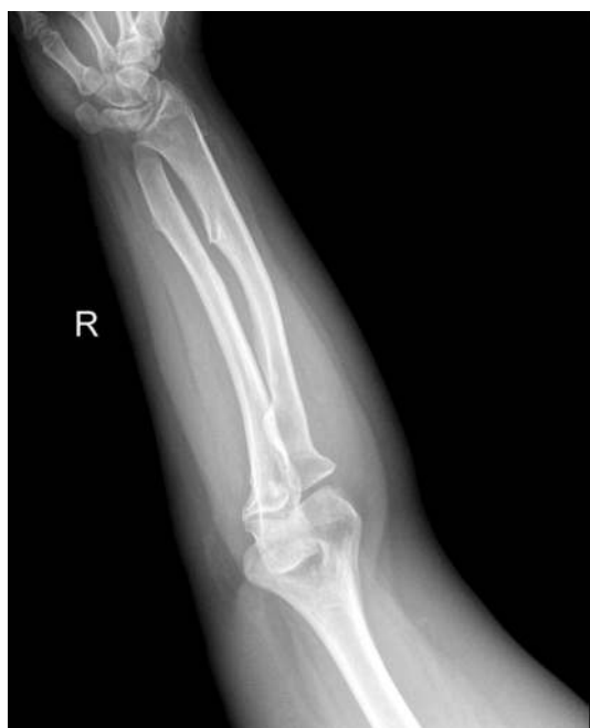
Fig. 3 Anteroposterior radiograph of a forearm at skeletal maturity: the radial head appears in the correct position