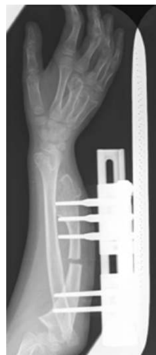
Fig. 1 Anteroposterior radiograph of a forearm 15 days after surgery: Correct positioning of the external fixator, removal of exostosis, and osteotomy of the ulnar shaft

The patients were operated on in the supine position under general anesthesia with the forearm on a radiolucent table. Before surgery, the forearm was maintained in a neutral position. The operative technique consisted of the removal of all the osteochondromas present in the ulna and the reduction of radial head dislocation. If the patient presented with a radio-ulnar distal synostosis, a radioulnar separation was performed. Subsequently, an ulnar transverse mid-diaphyseal subperiosteal osteotomy was performed and a unilateral external fixator was positioned. Before starting with the progressive lengthening we waited 4–7 days to let the hematoma appear, which stimulates callus formation. Once the elongation was obtained, the fixator was maintained for the time needed to reach the desired length. Care was taken to avoid neurovascular injury, swelling, and pin tract infection (Fig. 1). The external fixator was removed after an average of 135 (range 120–150) days.