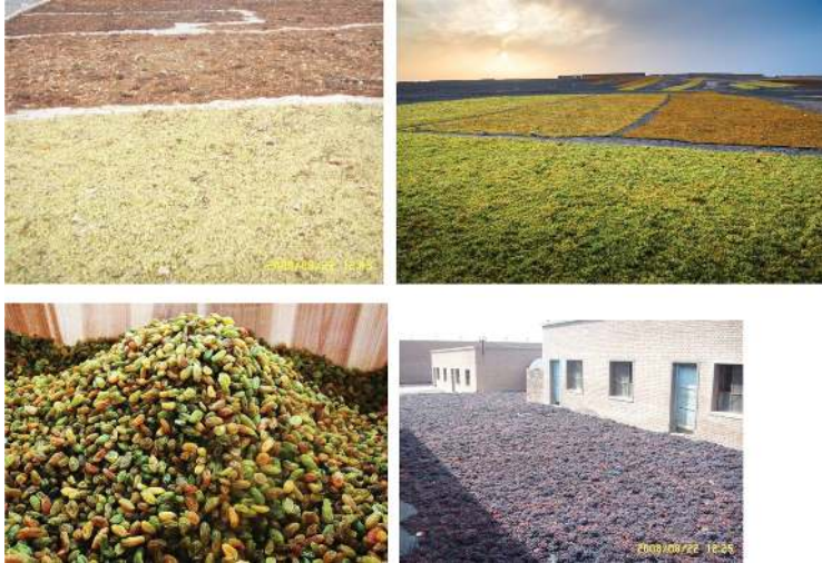
Figure 2. The open sun drying of grape into raisin.

that different temperatures have a significant effect on aroma profile of musts from the dried grapes, a less loss of raisiny aroma for a lower temperature was found.