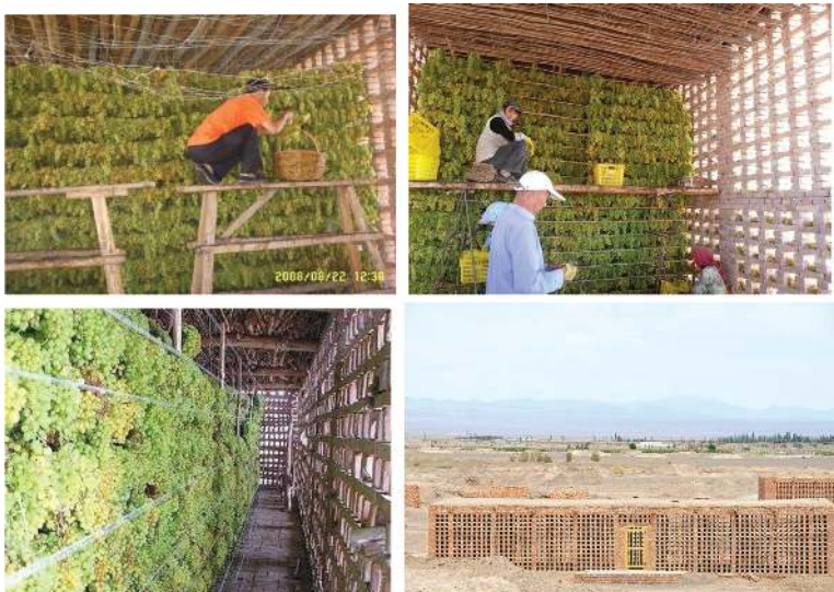
Figure 3. Shade drying of grape into raisin and the structure of shade-room.