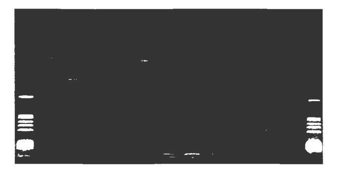
Fig. 2: VVS5 amplified microsatellite in 16 cultivars of Vitis vinifera . The first and last lanes are loaded with pBR322, Hae III digest, molecular marker. Lanes 2 - 12 represent 11 different groups of cultivars as listed in Tab. 2.

<sup>(2)</sup> The name Verduzzi includes all the populations of Verduzzo presented in Tab. 1.