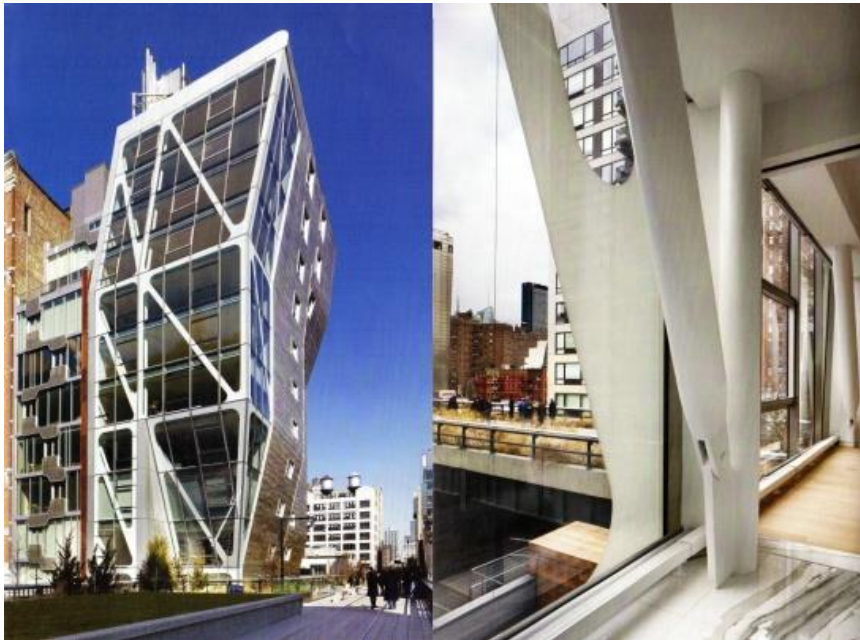
Figure 6. Denari, N (2005-12) HL-23, Exterior/Interior, New York

In a 2008 20 lecture espousing photographic metaphor, Neil Denari showed a VW logo beside a monochromatic axial photograph of a half-timbered German dwelling saying: "If on the one hand the Volkswagen logo is about a commercial, global world, it's also about a technique which is about trying to burn an image into one's eye." He continued that the half timbered façade works in the same optical way as the logo saying: "In terms of messages that they send, one is about offering a super graphical way of talking about structure, and the logo is about graphic, high contrast resonance. We'd like our work to borrow from both these paradigms." Further, he records an ambition to get, what he calls, "the Gursky effect" into his renders and buildings, referring to the work of the famous German photographer whose images are known for their graphic potency.