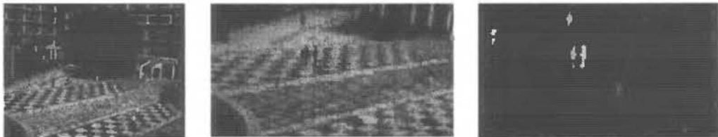
Figure 3: Typical Image from pedestrian plaza. Background mean image, input image with blob bounding boxes and blob segmentation image

The trajectories of each blob are computed and saved into a dynamic track memory . Each trajectory has associated a first order EKF that predicts the blob's position and velocity in the next frame. As before, the appearance of each blob is modeled by a Gaussian PDF in RGB color space, allowing us to handle occlusions.