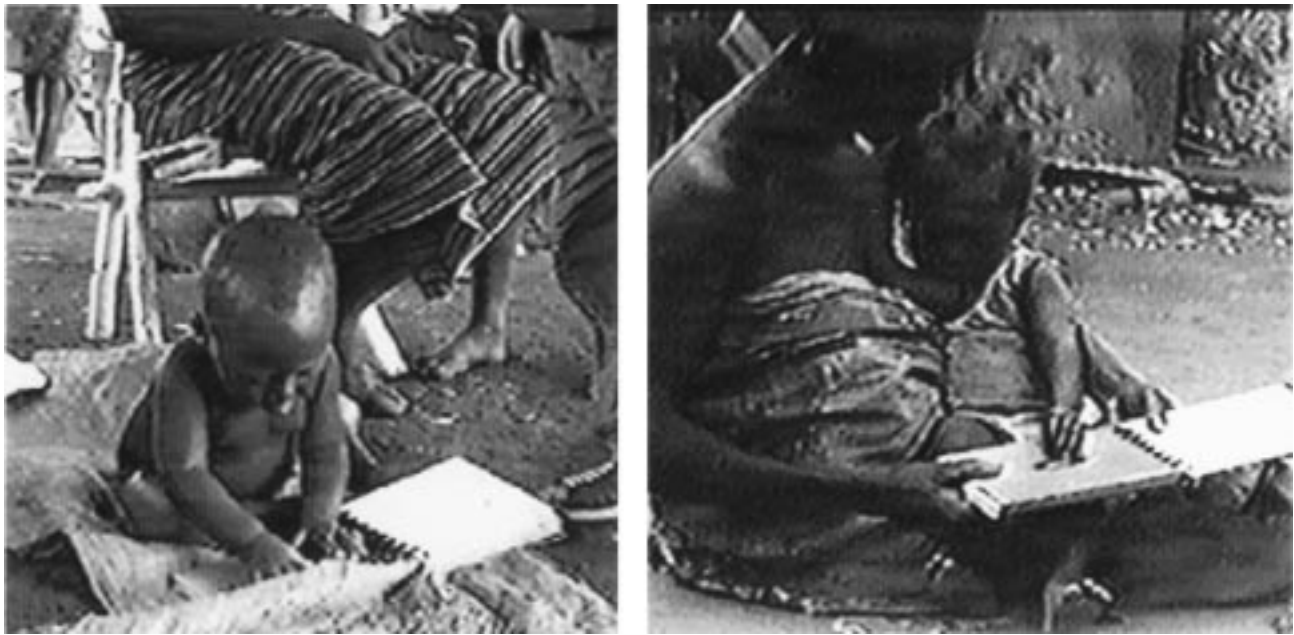
Fig. 2. Manual exploration of pictured objects by Beng infants from the Côte d'Ivoire (West Africa). Despite great differences in the testing situations, the Beng infants' response to the pictures was very similar to that of the American infants.