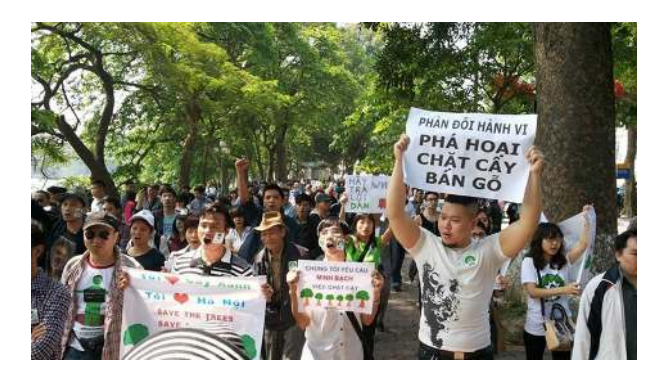
Fig. 4 Peaceful demonstration at the lake.