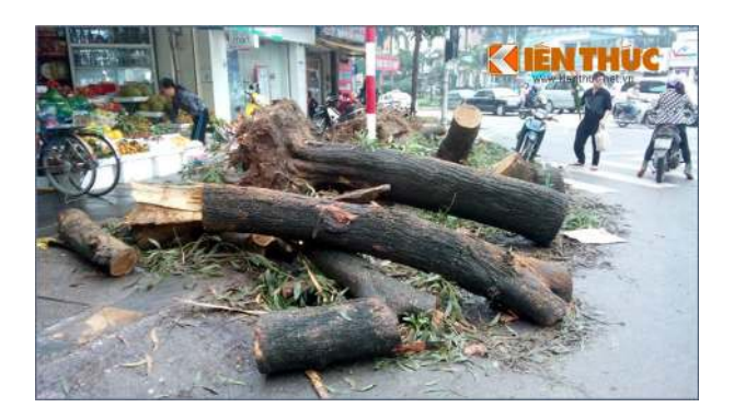
Fig. 2 Healthy old trees were chopped down. Hanoi looked like a construction site.

than being chopped down. It is heart-breaking. How many years do we have to wait to have shade from trees again, which is really needed in this city where thousands of street vendors and labourers are every single day grappling with the heat in burning summers? (Interview, 18 March, 2016, Hanoi).