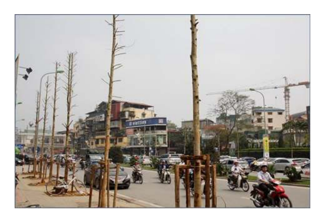
Fig. 3 Trees replanted in Nguyen Chi Thanh street after all big old trees in this street were chopped down. Source http://www.thanhnien.vn. Available at http://www.thanhnien.vn/thoi-su/ha-noi-thay-the-cay-xanh-cay-moi-trong-khong-phai-vang-tam-543702.html

fact Magnolia conifera , <sup>1</sup> a deciduous tree native to China which grows up to 30 m in height, and it is among species that are not recommended to be planted in urban streets (Thanh Nien News 2015). As quickly as within just a few days, Hanoi looked like a construction site with loads of large healthy trees being cut into logs and spread on the ground. Within a very short period of time, as many as 2000 trees which included a large number of old and valuable trees were completely cut down.