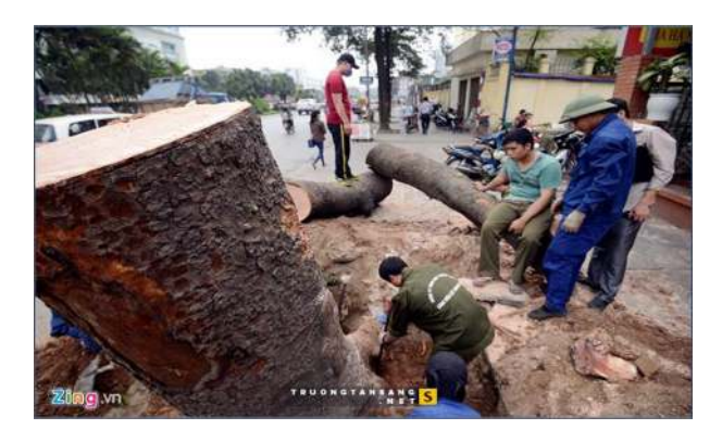
Fig. 1 Healthy old trees were chopped down. Hanoi looked like a construction site.